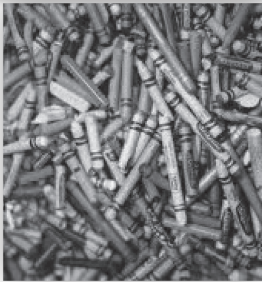
As part of its ongoing mission to educate the public about wise use of natural resources, Long Lake's team of Environmental Educators will share simple, everyday Conservation Tips that everyone, including kids, can do. If everyone makes the effort to consume resources more wisely, we can help ensure a brighter future for the planet and make life better TODAY!

Unfortunately, most crayons end up in landfills. Crayons are made of paraffin wax, a petroleum by-product, that is not biodegradable. In the U.S. alone, more than 60 million crayons are discarded each year. That is over 500,000 pounds of waxy sludge that won't decompose. Thankfully, crayons can be recycled. The National Crayon Recycle Program recycles unwanted, rejected, broken crayons into new crayons, keeping thousands of pounds out of landfills and back into the creative hands of children! Even the paper wrappings are recycled. They also have 100% recycled crayons available for purchase, eliminating the production of new crayons. Learn more about the program here: nationalcrayonrecycle-program.org