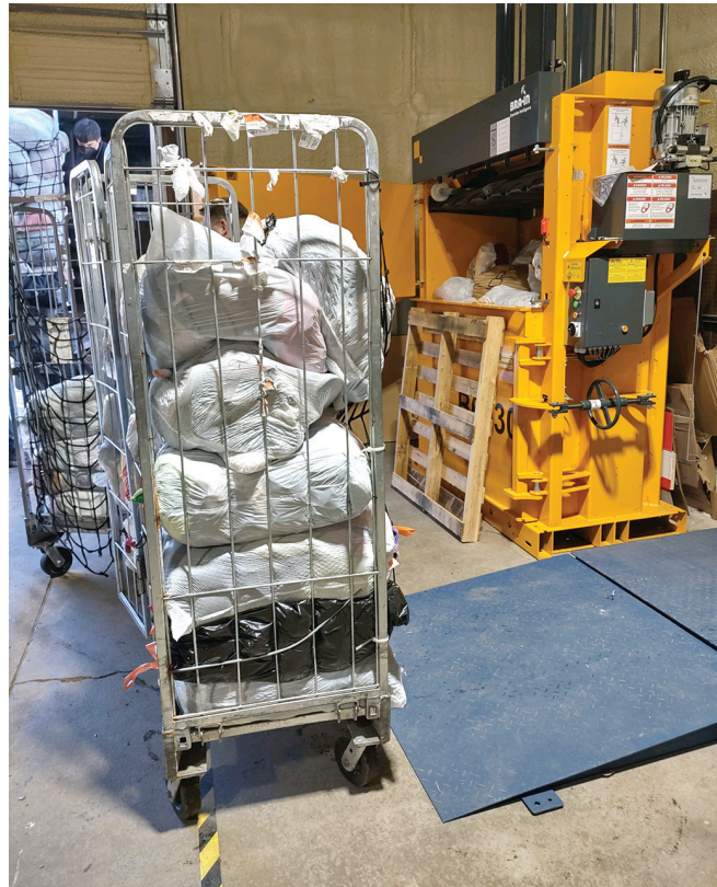
Bags of unsellable clothes and textiles are wheeled to the area where a baler, housed at Salem West, will compact the items into a bale to be transported for recycling.

Area nonprofit partners Bridges of Hope and Salem West are partnering in a textile recycling project.