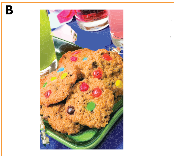
Answers: 1. Extra yellow candy 2. Candy no longer cracked 3. Ribbon missing 4. Drink is green