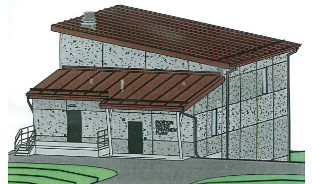
City of Ironton new water treatment plant exterior perspectives (left) looking southwest and (right) looking southeast.