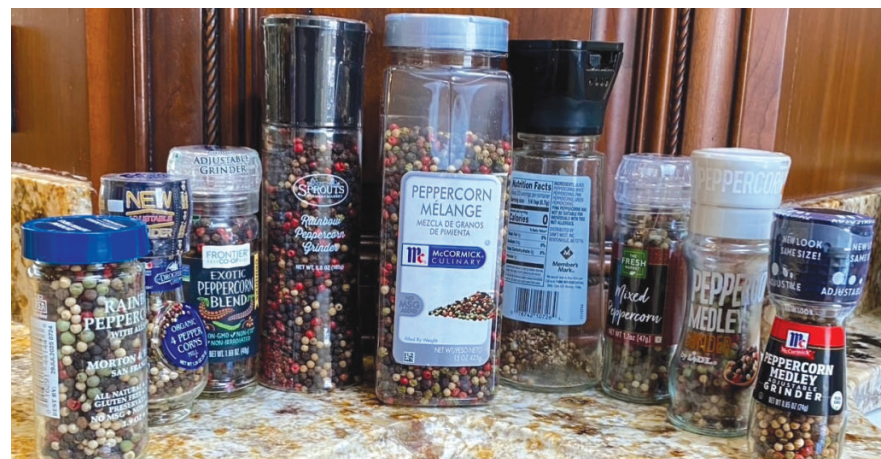
Pink peppercorns are listed on the ingredient labels of all these bottles. However, only the Walmart brand carries the warning that pink peppercorns may not be suitable for people with tree nut allergies.