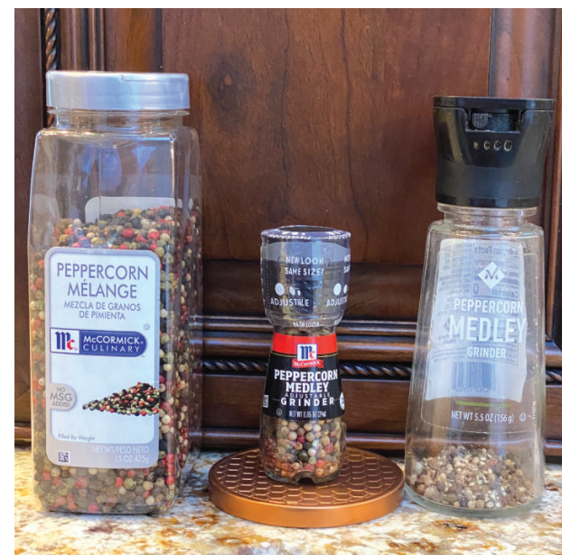
Bottle on the right, Walmart's Member's Mark brand does have a warning label.

Consumers and families continue to have reason to be concerned about inadequate food warning labels. When McCormick Company, the world's largest