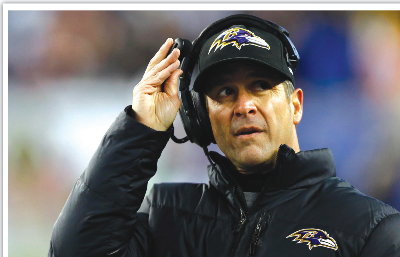
John Harbaugh

The Dolphins travel to Kansas City to face a Chiefs team that is more vulnerable than previous years. So, an upset could be in play. It's very possible that Miami ends up back at M&T Bank Stadium, where the Ravens blew them out 56-19 in Week 17.