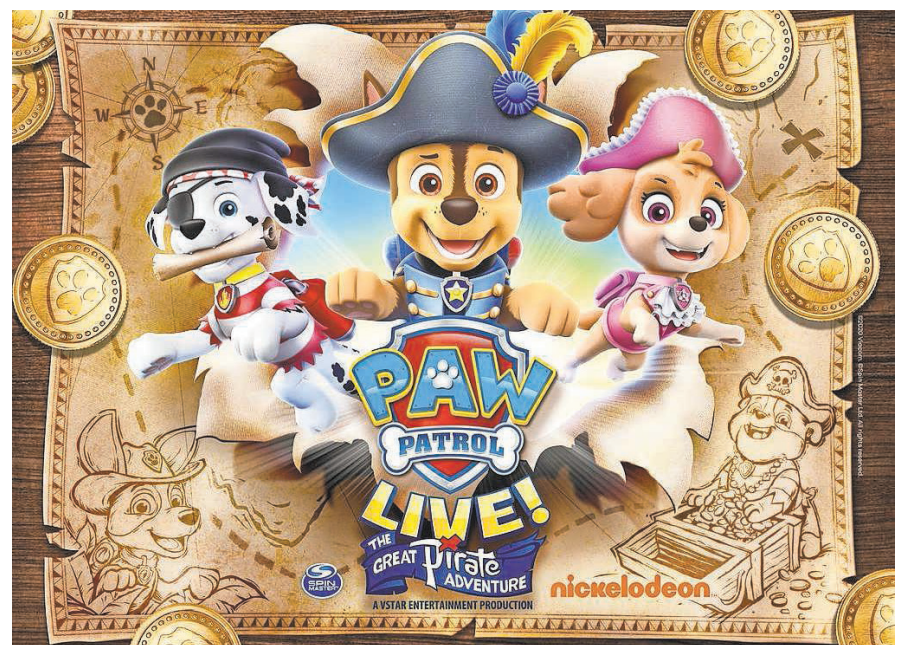
PAW Patrol Live! "The Great Pirate Adventure," brings the popular Nickelodeon cartoon to the stage. The production runs at the Hippodrome Theater Jan. 26, 2024 through Jan. 28, 2024.

Barricklo’s theater credits include portraying Wednesday in The