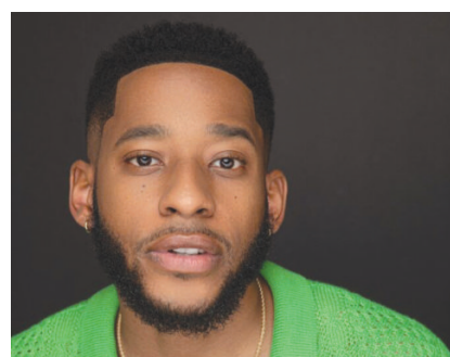
The Birth of Jazz Exhibit is January 12, 2024 starting at 6 p.m. with a round-table conversation featuring Jamal Moore at the Eubie Blake Center, located 847 N. Howard Street in Baltimore, Maryland and it is FREE!