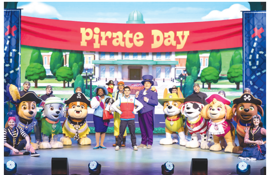
PAW Patrol®Live! "The Great Pirate Adventure" cast PAW Patrol®Live!

"Everyone has a lot of fun at the show," she said.