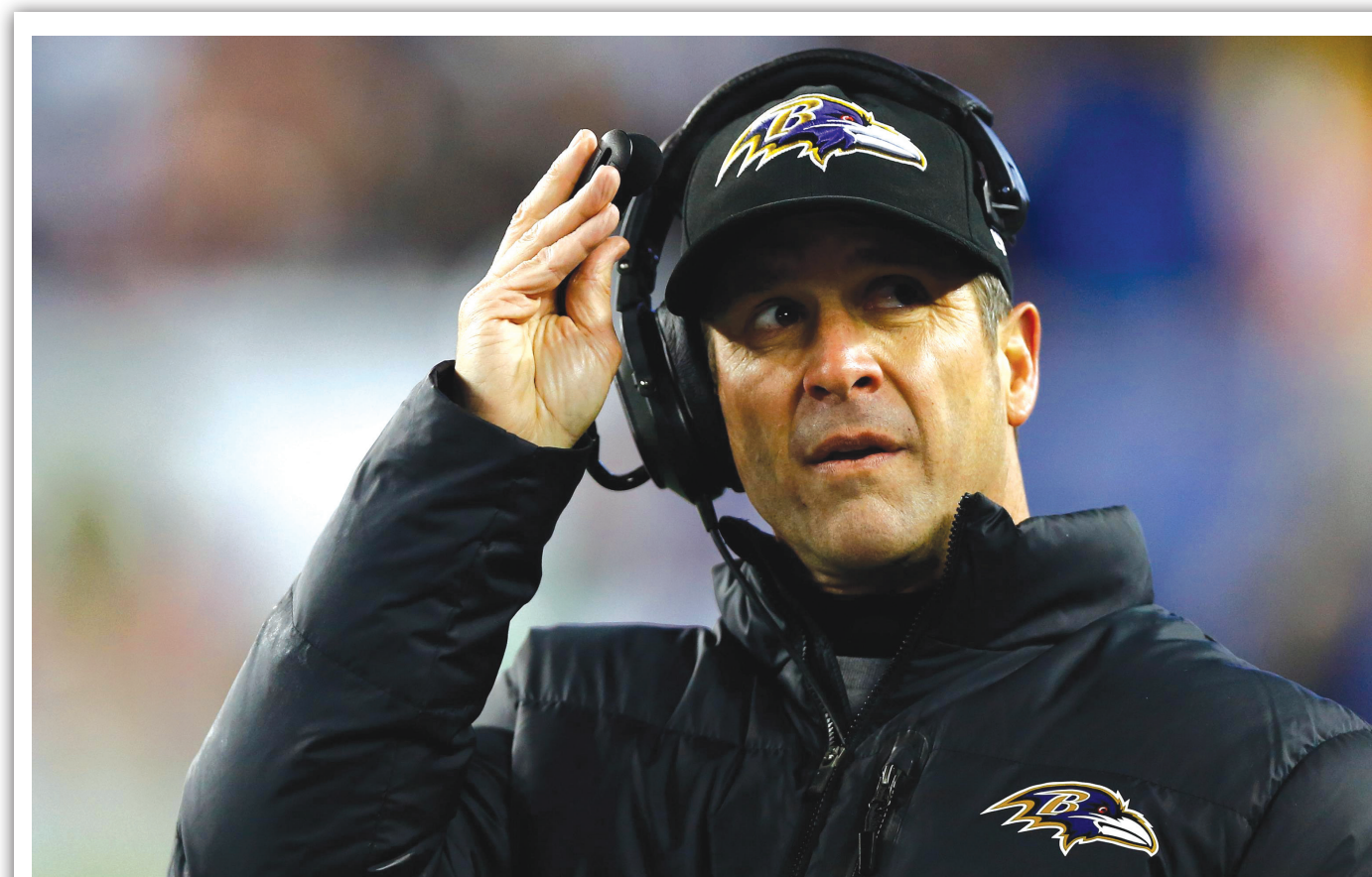
John Harbaugh

The Dolphins travel to Kansas City to face a Chiefs team that is more vulnerable than previous years. So, an upset could be in play. It's very possible that Miami ends up back at M&T Bank Stadium, where the Ravens blew them out 56-19 in Week 17.