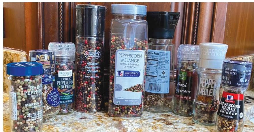
Pink peppercorns are listed on the ingredient labels of all these bottles. However, only the Walmart brand carries the warning that pink peppercorns may not be suitable for people with tree nut allergies.