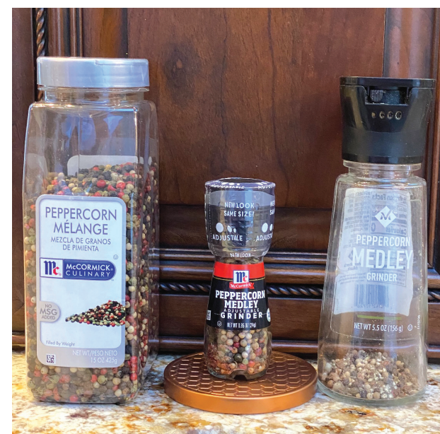
Bottle on the right, Walmart's Member's Mark brand does have a warning label.

Consumers and families continue to have reason to be concerned about inadequate food warning labels. When McCormick Company, the world's largest