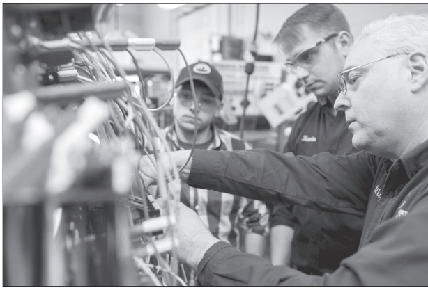
Students at Northern Maine Community College participate in hands-on training in the electrical construction and maintenance program. The Maine Community Foundation (MaineCF) offers hundreds of scholarship opportunities to Maine students, including those entering trades.

“There is no part of Maine we don’t reach and MaineCF scholarships offer support to students of all backgrounds and from all corners of the