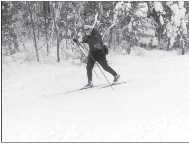
A classic skier glides along on Boggy Brook Trail