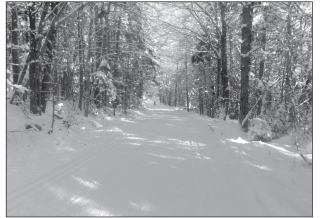
The Prospect Farm Wildcat River Trail resembled a Christmas card scene