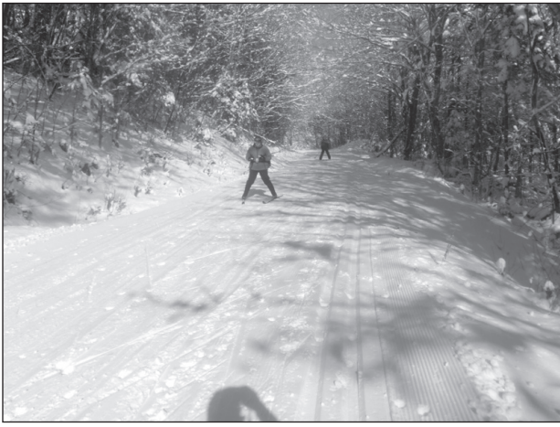
Skiers hold a snowplow on Prospect Farm Trails