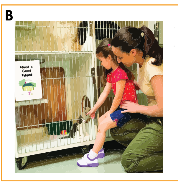
yas bolka dots Answers: 1. Sneakers have darker trim 2. Toy www.windsorpress.com

missing in eage 3. Sign says "Friend" 4. Shirt