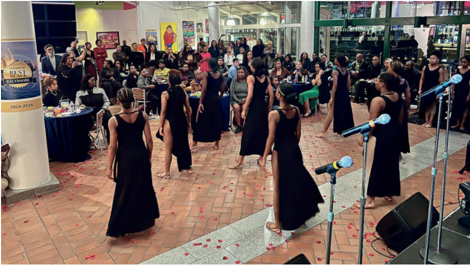
Fearless Dance Empire performs an inspirational piece to kick off the Best of Black Baltimore Celebration