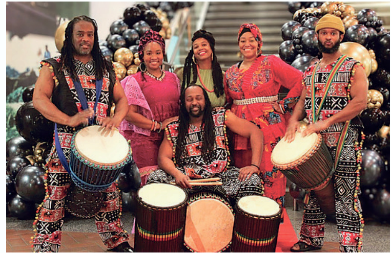
African dance company Xaala Mainama welcoming attendees on the red carpet.