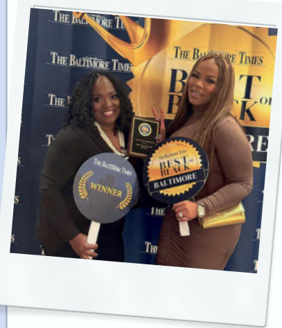
Winner of the Best Hair Salon: Affordable Styles Hair Salon