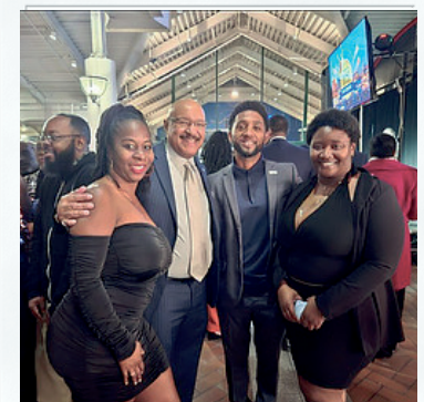
Mayor Brandon Scott poses with event attendees