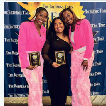
Best Dessert winner Sistah's Sweets and Best Skin Care Product NKVSKIN

If you missed the event, we have included a photo gallery recap. Enjoy!