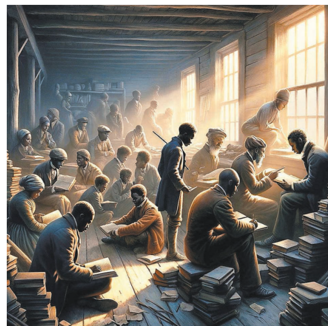
DALL-e AI assisted

The series is not just a recounting of past injustices; it is a call to action, urging stakeholders, including healthcare providers, policymakers, and patients, to address the critical