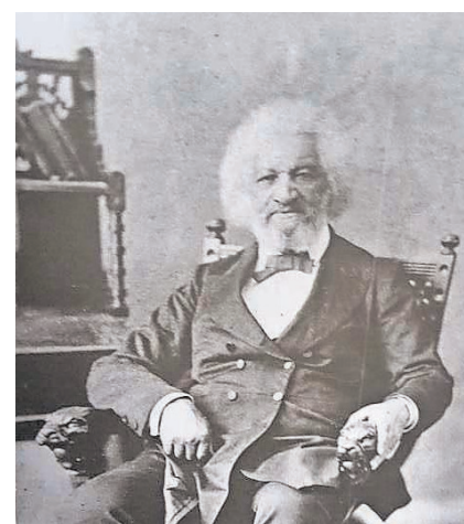
Frederick Douglass approved of his son's idea to start a community where persons of color could enjoy carefree summers without fear of discrimination so prevalent at that time.

Although restrictive covenants on deeds disallowed real estate sales to Blacks in other places, the private community evolved into a gathering place welcoming upper-class Black guests and residents who were educated or well-known. They