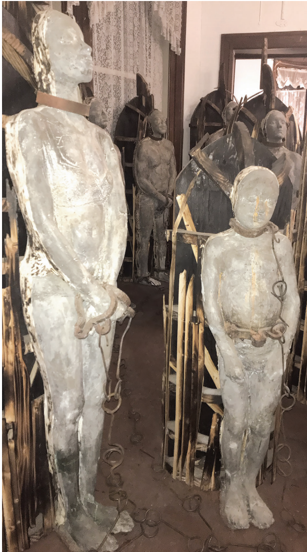
Concrete figures of an adult and child.