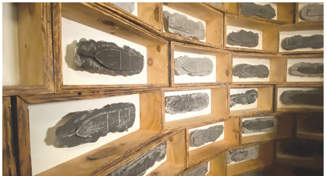
A wall display showcasing boxes Hayes made by hand.