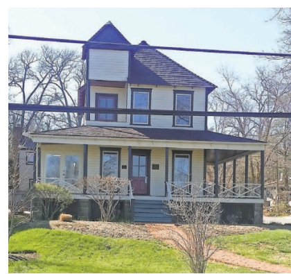
Frederick Douglass' summer cottage ("Twin Oaks") now houses the Frederick Douglass Museum and Cultural Center located at Highland Beach in Annapolis, Maryland.

"He worked to employ the first African-American teachers in the district's schools and assured they received equal pay," according to information provided online by the Frederick Douglass Museum and Cultural Center.