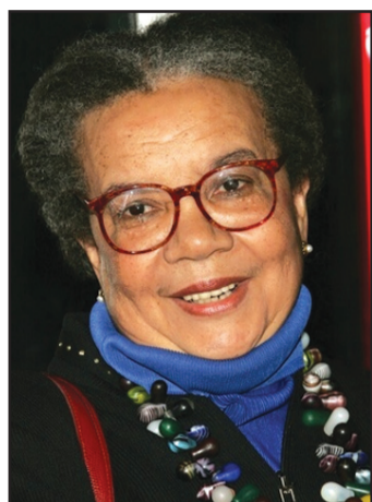
MARIAN WRIGHT EDELMAN

"Criminalizing poverty is big business" GUEST EDITORIAL PAGE 4