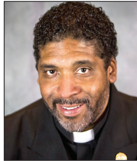
REV. DR. WILLIAM BARBER, II