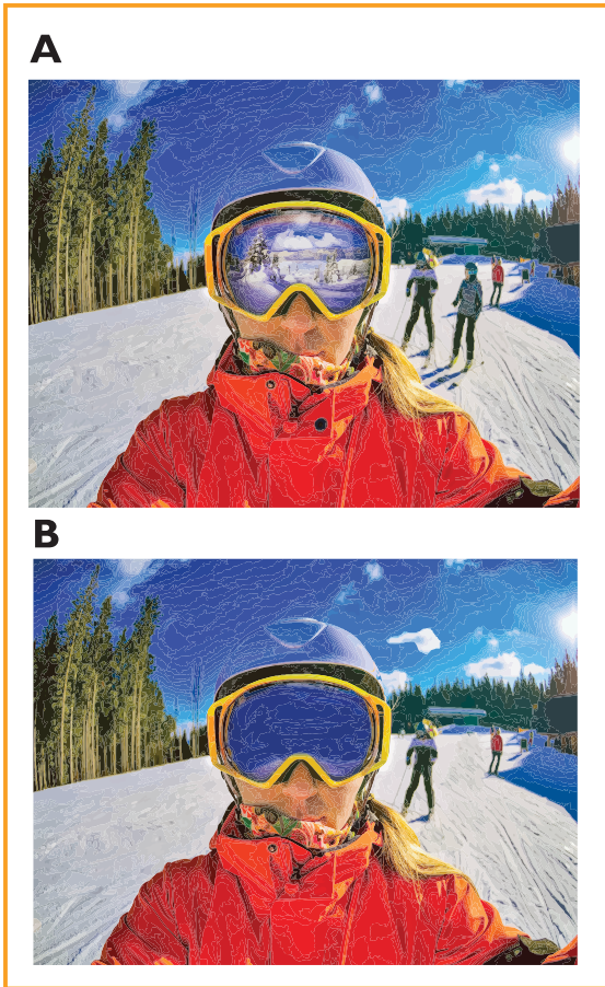
Answers: 1. Can't see reflection in goggles 2. Missing snag on coat 3. Extra cloud in sky 4. Missing person in background

There are four things different between Picture A and Picture B. Can you find them all?