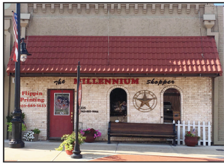
Flippin Printing located inside The Millennium Shopper at 115 Jefferson in Sulphur Springs.