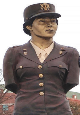
LTC CHARITY ADAMS - FIRST COMMANDING OFFICER