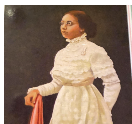
Nellie Quander, educator, advocate of women's rights and the first National President of Alpha Kappa Alpha Sorority. Her likeness is featured at The National Great Blacks in Wax Museum in Baltimore, Maryland.

"But organizers, acceding to racists in states that needed to ratify the 19th Amendment, sought to isolate Black women. In a letter to Paul, Quander made clear she was having none of it. On the day of the procession, "Nellie and her group refused to take a place in