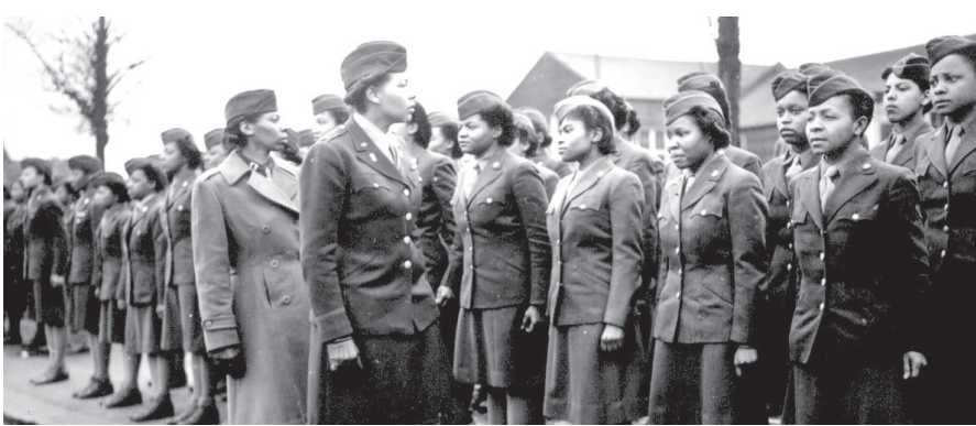
The 6888th Central Postal Directory Battalion, nicknamed the “Six Triple Eight,” was the only predominantly African American battalion in the Women’s Army Corps (WAC).