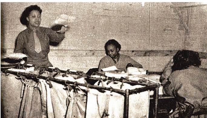
The 6888th Central Postal Directory Battalion successfully sorted through a two-year backlog of undelivered mail.