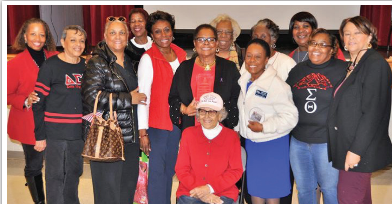
The Baltimore County Delta Foundation members.

Governor Wes Moore has proclaimed March 9, 2024 as “6888th Day in Maryland,” inspiring the BCDF to offer a special tribute to the predominantly Black, all-women’s battalion. The Baltimore County Delta Foundation was established in 2010 and it is committed to