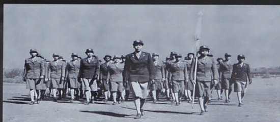
CAPTAIN CHARITY ADAMS AND OFFICER CANDIDATES - PARADE GROUNDS, FORT DES MOINES, IOWA (1943)

CENTRAL POSTAL DIRECTORY BATTALION WOMEN OF DETERMINATION, DEDICATION, AND DISTINCTION MOTTO: "NO MAIL, LOW MORALE" NICKNAME: "SIX TRIPLE EIGHT"