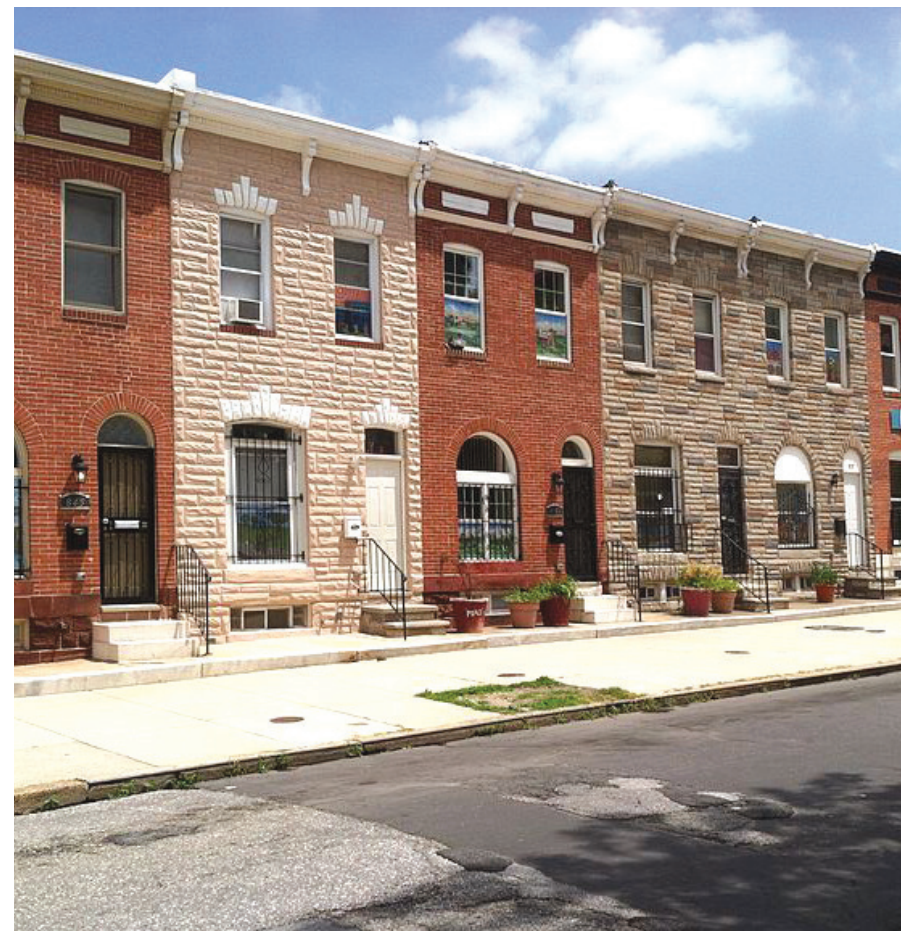
Row houses in East Monument Historic District, Baltimore, Maryland.

The next program you can use is the Maryland Homestead Property Tax Credit Program. This program helps