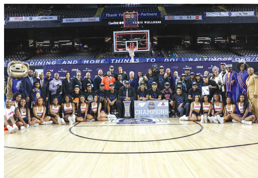
The Lincoln University men's basketball team won the 2024 CIAA Basketball Tournament.