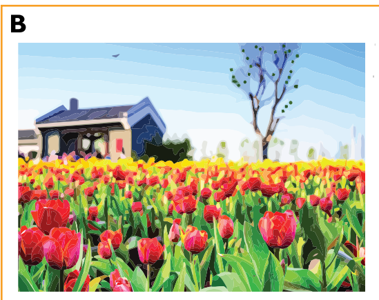
Answers: 1. Missing tulip front right 2. Leaves on tree 3. House has chimney 4. Bird in sky