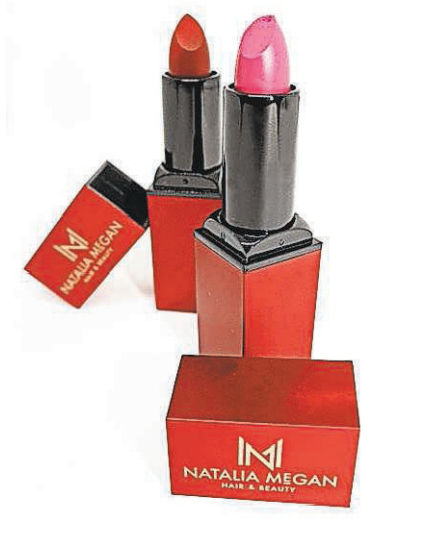
Temptation red and Erotic hot pink lipstick

Not only did Quattlebaum plan her escape, but she eventually remarried. Quattlebaum explored entrepreneurship in 2018 to bring beauty products to market after she