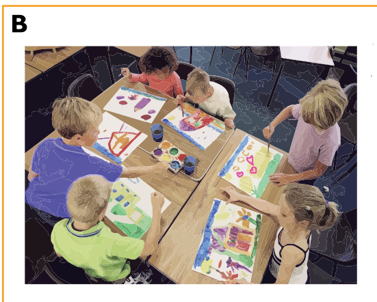
Answers: 1. Boy's shirt is purple 2. Missing cloud on picture 3. Two cups on table 4. Hearts on girl's picture