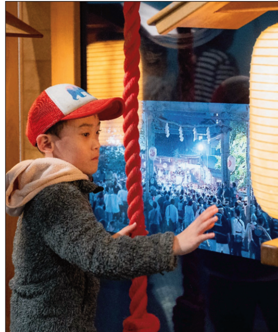
Local families will have the opportunity to experience present-day Tokyo and explore ancient and contemporary traditions of Japanese culture.

For more information about the museum, visit www.cdm.org .