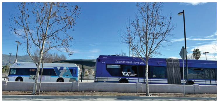
South Bay transit leaders have approved a major contract to construct a long-planned light rail extension project in East San Jose.

SERVING EVERGREEN AND SILVER CREEK VALLEY SINCE 1982 ■ EVERGREENTIMES.COM