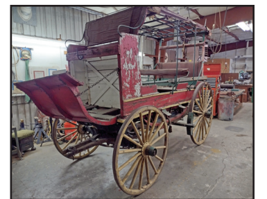
Above: Stage wagon as received, and below: stage wagon as of March 19.