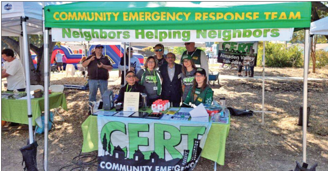
CERT volunteers have revved up their activities in the last year and are better organized, better trained, and more ready than ever.

MARCH 29 - APRIL 11, 2024 ■ VOL. 37, NO. 7