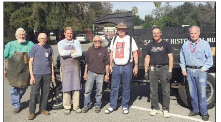
History San Jose's Restoratoin Shop volunteers restored a 1927 T Truck.

True emotion captured when the President of BTC surprised them with the word collage and shared how much the boys appreciated their leadership, time and connection all throughout the years.