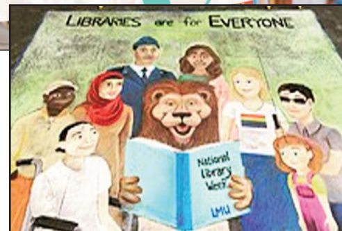
Artwork created for National Library Week at Loyola Marymount University, 2017.

First sponsored in 1958, National Library Week (NLW) is observed in the United States and is sponsored by the American Library Association (ALA) and libraries across the USA each April, typically the second full week. It promotes library use and support.