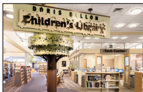
Almaden Library is getting ready for National Library Week.