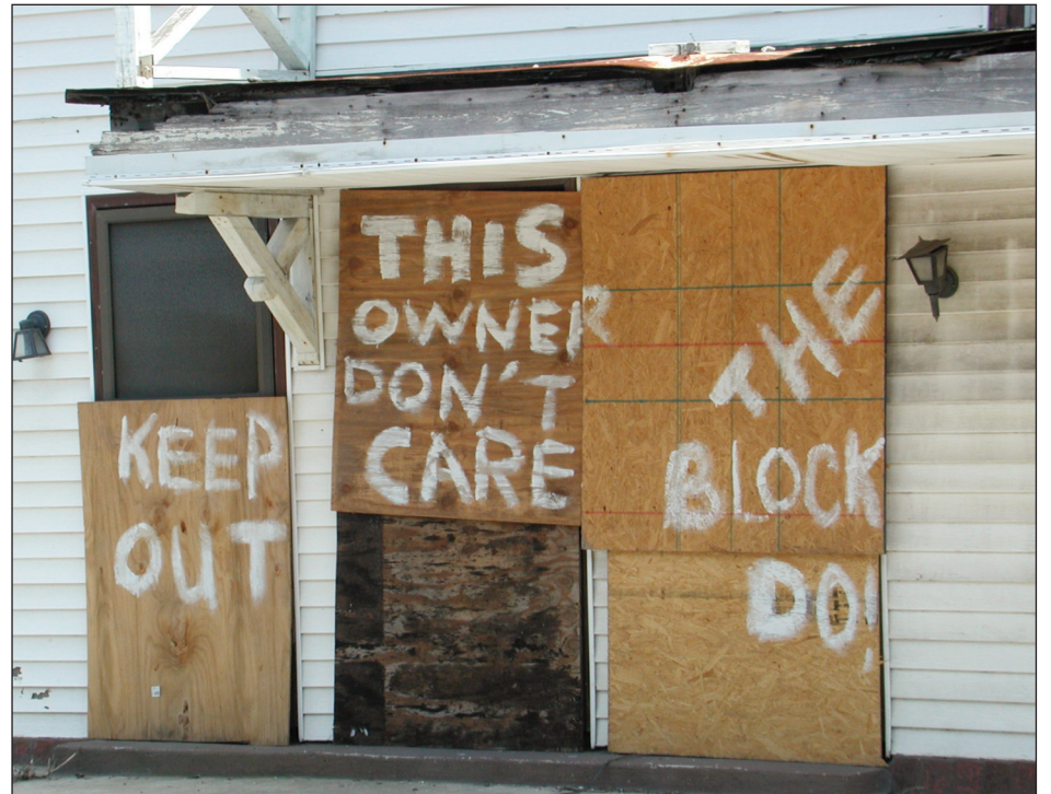
If the real concern is blighted property, then the solution is simple: adequate and responsive code enforcement targeting problematic properties effectively.