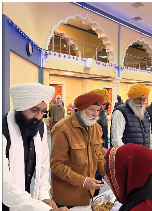
San Jose Gurdwara members preparing food in November 2023.

More than 300 years ago in the country of India, the revered 10th Guru of the Sikh religion, Guru Gobind Singh Ji decided to create a new festival which would promote strength and courage. Also, beautiful words of poetry combined with traditional music were included with the court