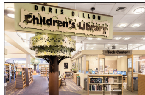
Almaden Library is getting ready for National Library Week.