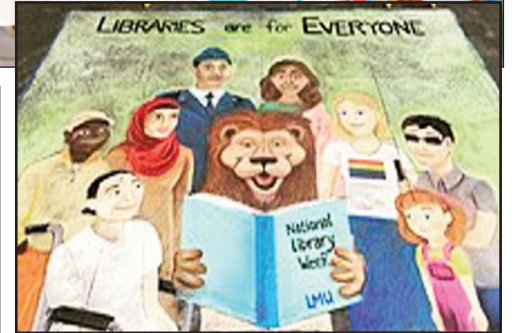
Artwork created for National Library Week at Loyola Marymount University, 2017.

First sponsored in 1958, National Library Week (NLW) is observed in the United States and is sponsored by the American Library