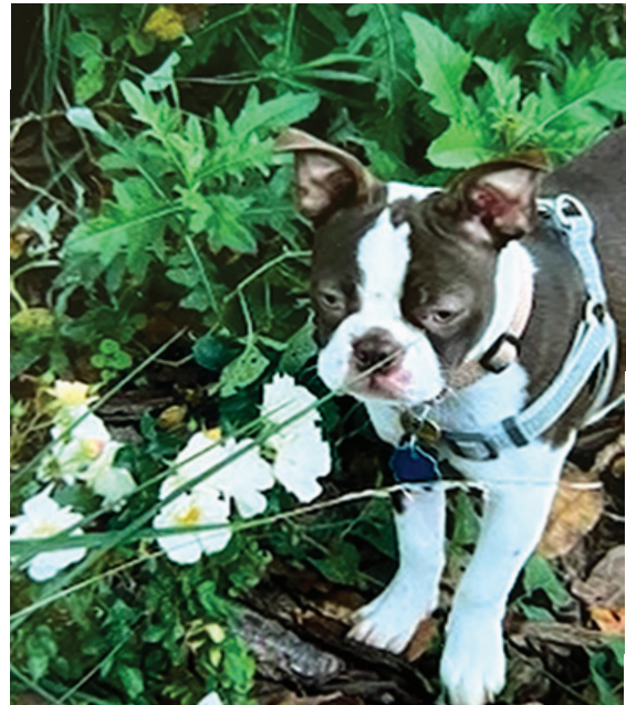
“Rocky” Owner Rebecca Randazzo of Lowell.

“Pet Contest” Send an original photo of your pet with a caption and if we publish it, you win a check in the mail. Send photos to: Pet Photo Contest P.O. Box 1004, Crown Point, IN 46308 Sorry, we cannot accept scanned photos.