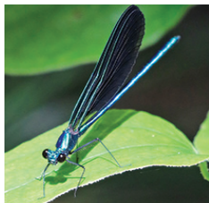
"Ebony jewelwings are often seen along the banks of forested creeks."

Dragonflies and damselflies are common sights along the shorelines of streams, rivers, lakes, ponds and other bodies of water. Most of them are very colorful and downright beautiful, and the Ebony Jewelwing Damselfly is no exception. Found throughout most of eastern North America, males of this stunning member of the damselfly family have a shiny metallic blue-green body and jet black wings. It is a sight you won't soon forget.