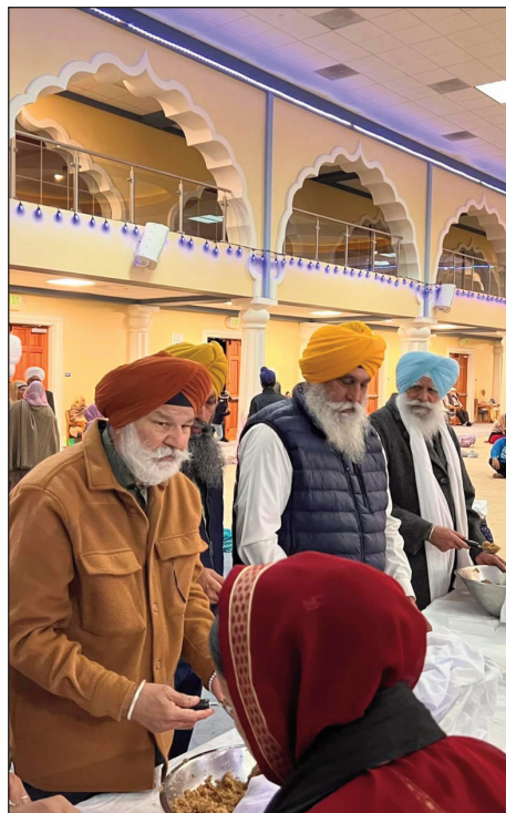
San Jose Gurdwara members preparing food in November 2023.

The festival continued year after year worldwide and was welcomed to Evergreen Valley over a decade ago at our community center open to everyone. Gurdwara on the Hill is the largest Sikh Gurdwara (Religious Temple and Community Center) in the United States.