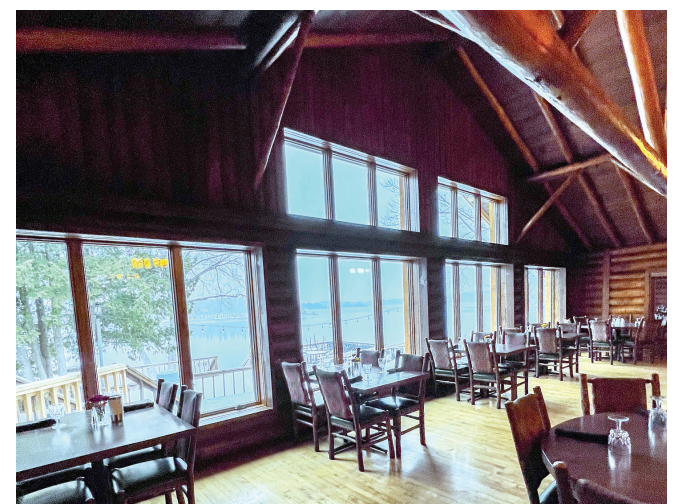
The recent renovation of Ruby's Dining Room windows and exterior façade, still showcase the beautiful view of Bay Lake.

To learn more, visit OdysseyResorts.com .