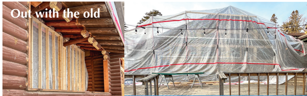
Out with the old