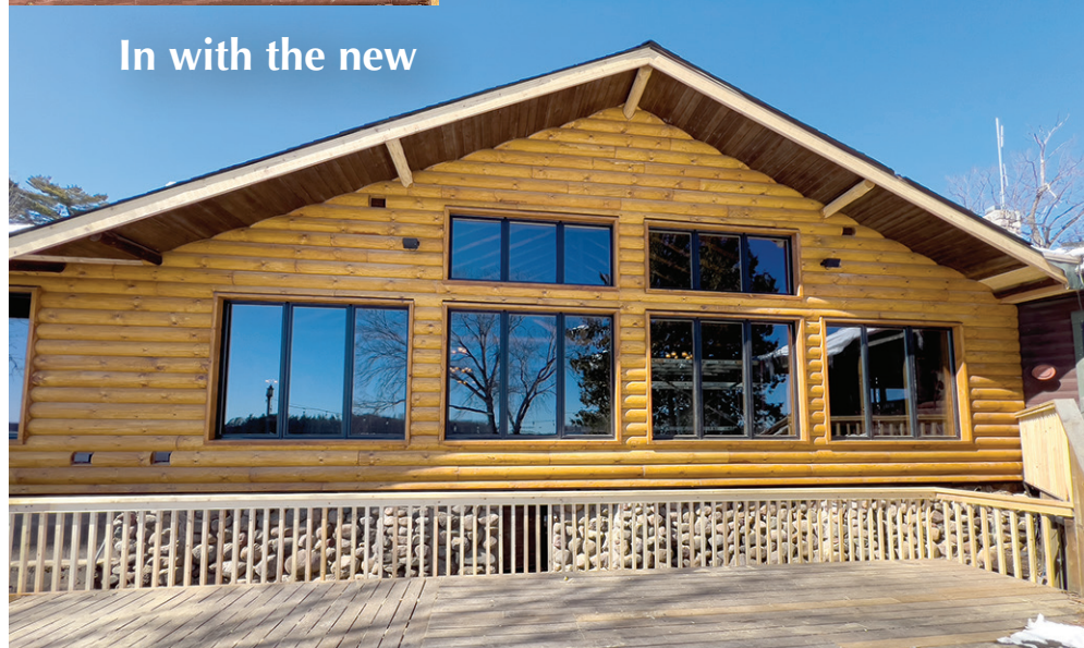
In with the new

swimming pools will open to the public in June of 2024. Hibert's, the new bar, is targeted to be completed in time for the resort's annual Oktoberfest celebration in October of 2024.