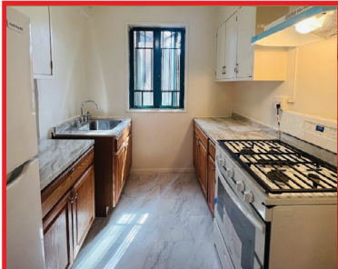
FOR RENT: 1946 East Tremont Avenue, 4E 2-Bedroom for rent at $2,918 Located in Parkchester