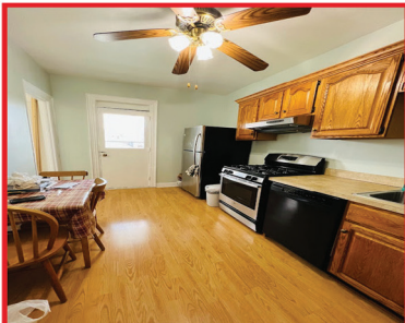
FOR RENT: 1624 Purdy Street, 2nd Fl. 3-Bedroom for rent at $3,600 Located in Parkchester