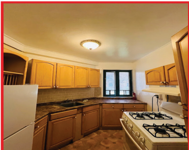
FOR SALE: 1946 East Tremont Avenue, 5A 2-Bedroom for Sale at $290,000 Located in Parkchester