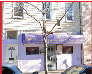
FOR SALE: 2426 Westchester Avenue 3 Fam w/office space For Sale at $1,399,000