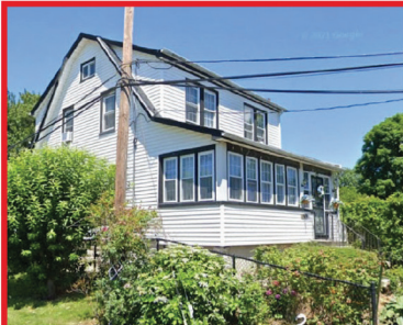
FOR SALE: 3949 Rombouts Avenue 2-fam house for sale at $850,000 with parking located in Eastchester.