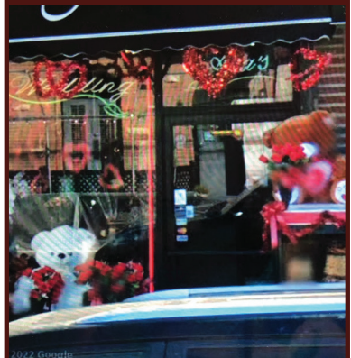
PELHAM BAY , FLORIST FOR SALE Turnkey, prime location!