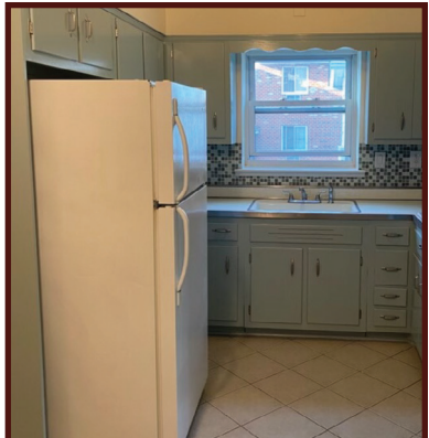
PELHAM BAY FOR RENT 2 bedroom, plus small room for office. Small pet ok, walk to 6 train

VISIT OUR WEBSITE TO VIEW MORE PHOTOS OF THESE LISTINGS AND OUR OTHER LISTINGS!