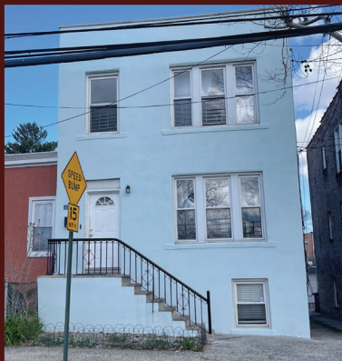
PELHAM BAY - FOR SALE 2899 LASALLE AVE. OPEN HOUSE , SATURDAY 4/13 FROM 12-3 2 family, det, brick 3 bedroom, 2 bedroom, 1 bedroom. Det, garage