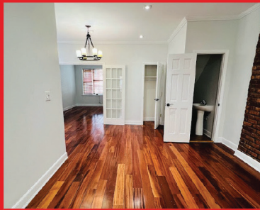
FOR RENT: 287 Logan Avenue, 1st Fl 1-bedroom 1.5 bath for rent at $2,400. Utilities included. Located in Throgs Neck.