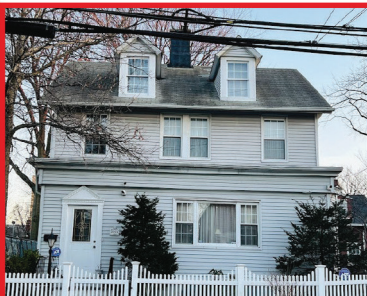
FOR SALE: 3014 Baisley Avenue Price Reduced! 2 fam house for sale at $1,299,000 Located in Throgs Neck. 4,900 Sq Ft, corner lot.