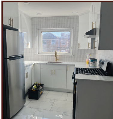
COUNTRY CLUB, FOR RENT 3 bedroom, with Balcony 2nd fl.