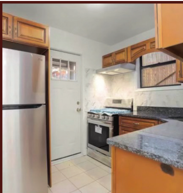
MORRIS PARK, FOR RENT 2 bedroom, 2 bath, cat ok close to Einstein hospital