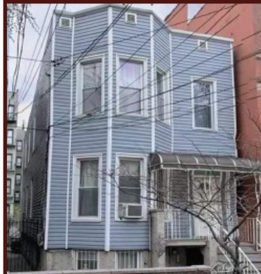
187 TH , ARTHUR AVE, FOR SALE 2 family, detached frame, 4 bedroom, 3 bedroom, basement . Close to Fordham University