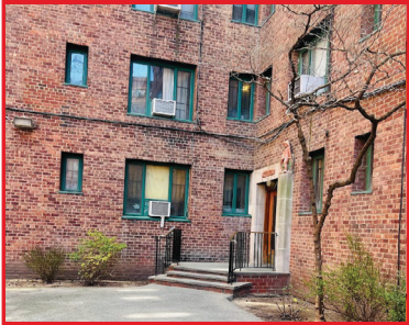
FOR SALE: 1680 Metropolitan Ave, Apt. #1 3-bedroom Condominium. $310,000 Located in Parkchester.