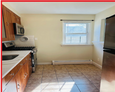
FOR RENT: 5462 Valles Avenue, 2nd Fl. 3-Bedroom for rent at $3,000 Located in Riverdale