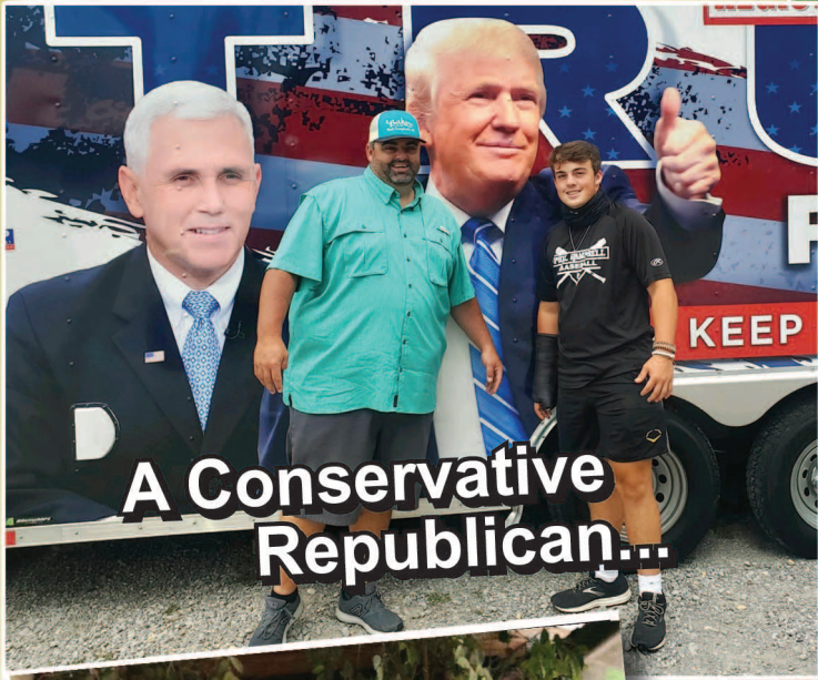
A Conservative Republican...