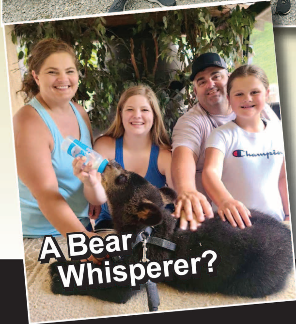
A Bear Whisperer?