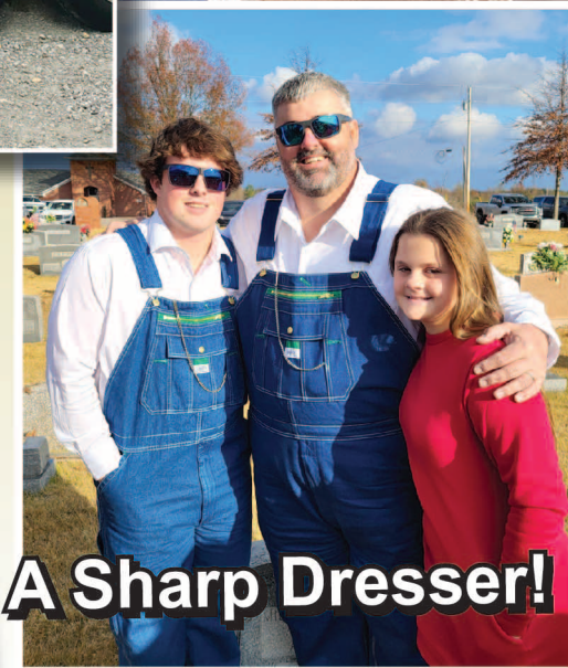
A Sharp Dresser!