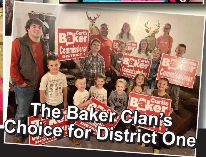
The Baker Clan's Choice for District One