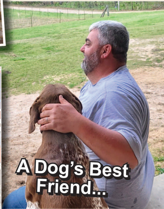
A Dog's Best Friend...