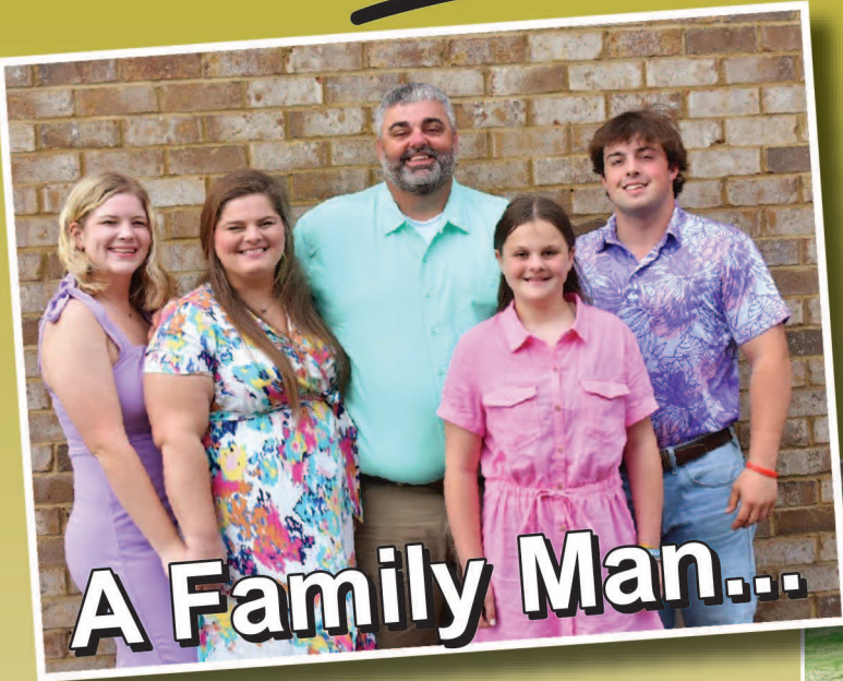
A Family Man...