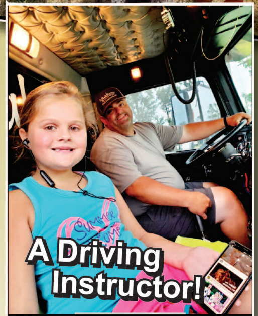
A Driving Instructor!