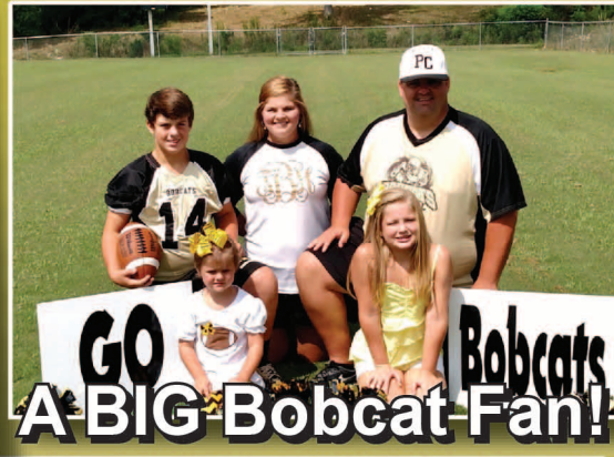
A BIG Bobcat Fan!