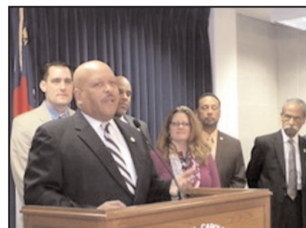
CAROLINIAN PHOTO REPRESENTATIVE RODNEY MOORE INTRODUCES BILL TO GENERAL ASSEMBLY.