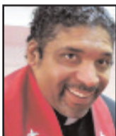
Rev. William Barber

Looking at our nation and noting where we have come since 1965 gives us reason to celebrate. However, in our celebration we should be mindful that true equality was never achieved, and that instead of moving towards justice we are moving in the other direction.