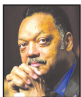
Rev. Jesse Jackson, Sr.

President Obama marked the 50th anniversary of Selma by celebrating the ordinary heroes who sacrificed so much to make America better.