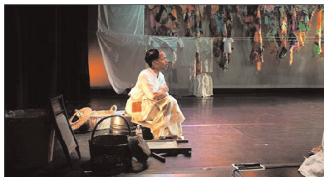
THE CLOTHESLINE MUSE