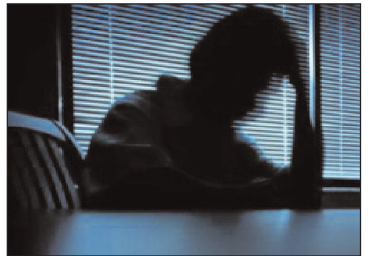
There are 25 mental health clinics or Core Service Agencies (CSAs) in the District.

BY LINDA POULSON OF THE AFRO-AMERICAN NEWSPAPER