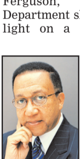
Dr. Benjamin Chavis Jr.

The U.S. Department of Justice (DOJ) report on the Ferguson, Mo. Police Department sheds a brighter light on a serious racial