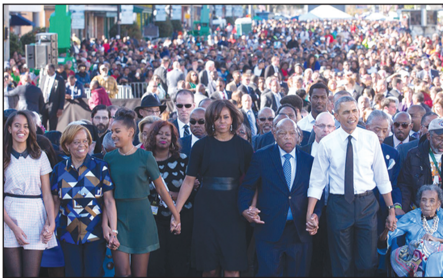
The Obama family join hands as they begin the march with the foot soldiers across the Edmund Pettus Bridge.