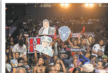
Howard students showed their solidarity and fandom for the ADW cast with blow up poster boards of the casts faces and the HU bison logo.

godfather to his daughter. Jasmine Guy said Charnele Brown and she were thick and thieves. Bell and Glynn Turman were emotional and shed some tears when speaking about the mentor-mentee relationship they had.