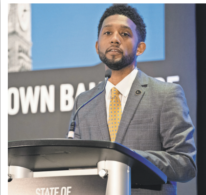
Mayor Brandon Scott

highlighted legislative support for downtown development initiatives.