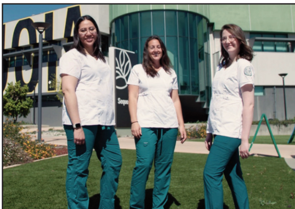
Nursing group take a break from their nursing program classes at Evergreen Valley College. The college's nursing program has achieved a 100 percent rate on the National Licensure Examination.

While the 100 percent pass rate for nursing