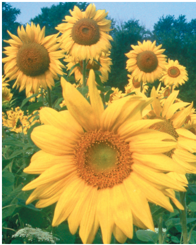
Serving Eastern Berks & Western Lehigh Counties.

VOLUME 64 - NUMBER 18 - MAY 1, 2024 OUR 64th YEAR