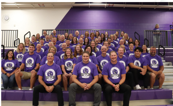
HIGH SCHOOL STAFF