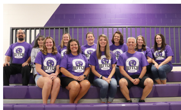
SUMMER CLEANING CREW