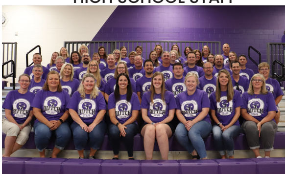
MIDDLE SCHOOL STAFF