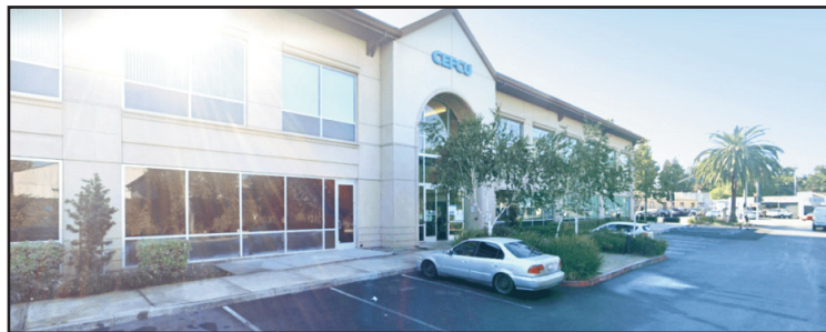
The River Church Community is pictured in this San Jose Spotlight file photo.

SERVING WILLOW GLEN, SAN JOSE ■ WWW.WILLOWGLENTIMES.COM