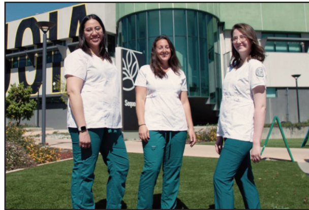
Nursing group take a break from their nursing program classes at Evergreen Valley College. The college's nursing program has achieved a 100 percent rate on the National Licensure Examination.

and focus. It is also a testament to our faculty's dedication to providing a supportive and challenging learning environment that prepares our students for real-world healthcare challenges."