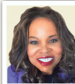
Jayne Hopson Courtesy Photo

In the Middle Ages, gout became known as the “disease of kings” or “rich man’s disease,” attributed to excessive indulgence in rich foods and alcohol. Notable historical figures including King Henry VIII of England and Sir Isaac Newton were gout sufferers, lending the disease a certain notoriety and linking it