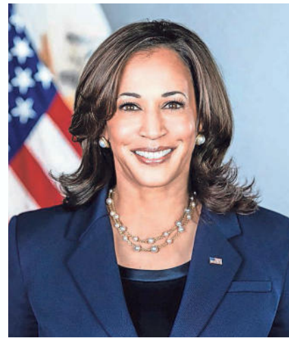
Vice President Kamala Harris

understand that you can't truly invest in the strength of our nation if you don't pay attention to diversity, equity and inclusion."