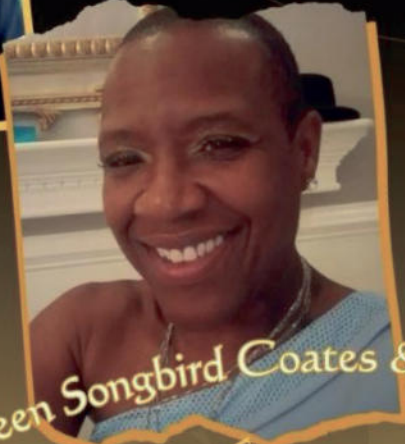
Queen Songbird Coates & Band