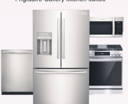
April 18, 2024 - July 10, 2024*

$350 off qualifying 3-piece Frigidaire Gallery kitchen suites