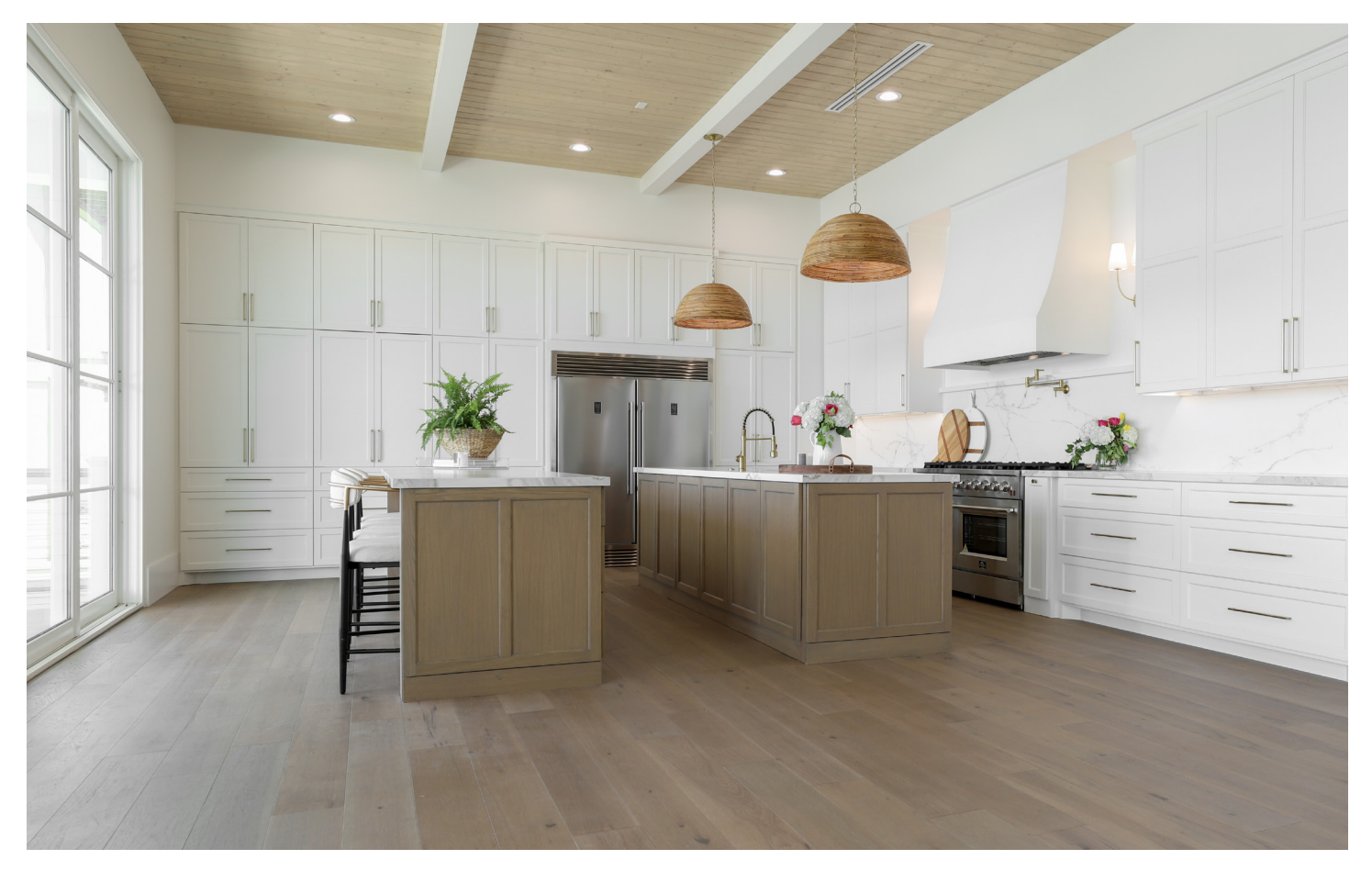
4,310-square-foot interior includes seven bedrooms and five full bathrooms.

"I like to build high-end luxury houses that have a 'Wow' factor. Everything about this house will make you say 'Wow!"" Nick stated.