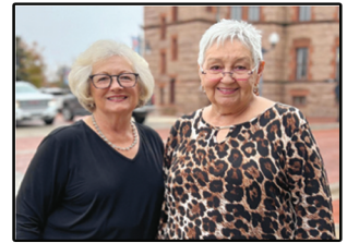
See Joy or Pat!

We can print yard signs, banners, window signs for your office, political signs, etc. If you can imagine it...we can print it!