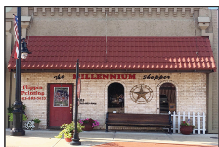
Flippin Printing located inside The Millennium Shopper at 115 Jefferson in Sulphur Springs.