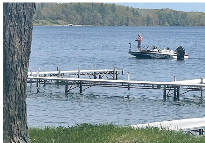
Anglers enjoyed fishing while a fashion show commenced at Ruttger's Resort on Bay Lake.

out there. The reef is rock and gravel on the west side, switching to rocky gravel with larger boulders further