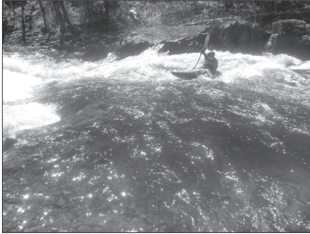
Suzanne Cole prepares to kayak down a precipitous descent on Kingsbury Stream