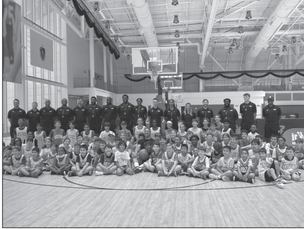
Team photo of last year's campers

skills in a safe and inclusive space. For more information, please visit Jr. Celtics Academy at https://www.nba.com/celtics/jrceltics