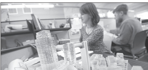
Architecture students with 3-D building models