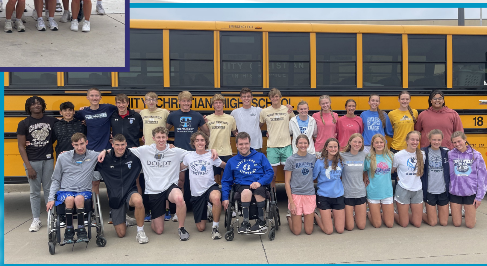
UNITY CHRISTIAN TRACK & FIELD TEAM

THESE BUSINESSES WISH TO SAY CONGRATULATIONS TO THESE TEAMS FOR MOVING ON TO POST-SEASON PLAY!