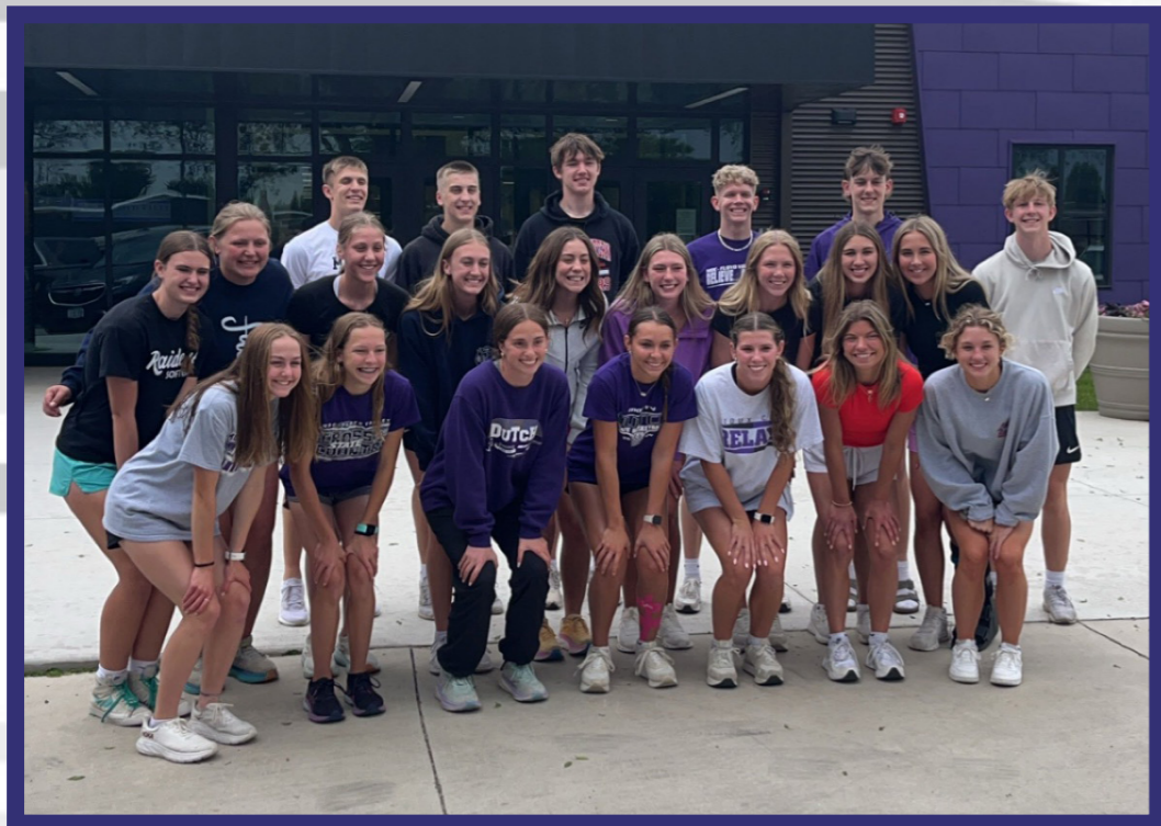
MOC-FLOYD VALLEY TRACK & FIELD TEAM

THESE BUSINESSES WISH TO SAY CONGRATULATIONS TO THESE TEAMS FOR MOVING ON TO POST-SEASON PLAY!