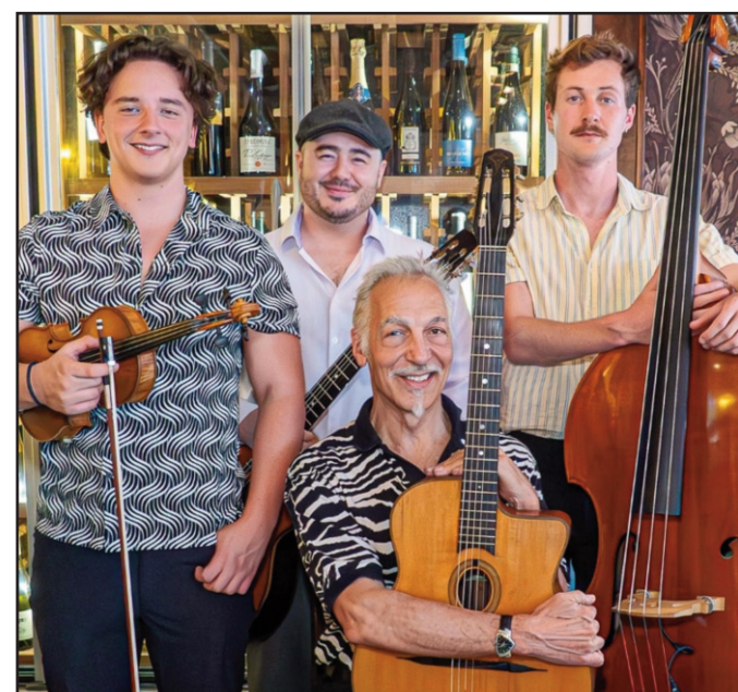
Photo courtesy of Le Jazz Hot Quartet and Jazz On The Plazz. They perform worldwide, keeping this historic music alive and vibrant. www.lejazzhot.biz

Editor's note: The festival features a new concert every Wednesday evening through August 21. All performances are free to the public. For list of all performances, visit: jazzontheplazz.com More Information: call 520.360.1206.