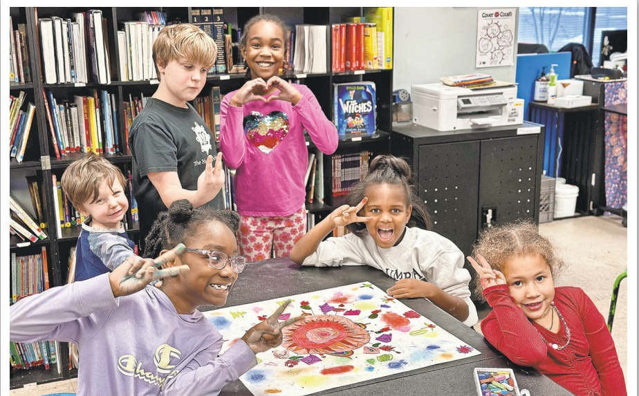
Mandala School Students