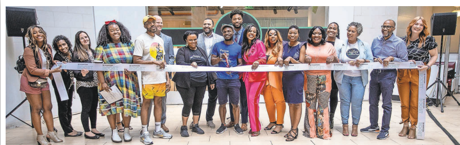
MCB Real Estate and Downtown Partnership of Baltimore unveiled the recipients of the Downtown BOOST Harborplace Local Tenancy Program, an initiative that will bring seven local Black-owned businesses to Harborplace. A ribbon-cutting ceremony was held on the afternoon of May 29, 2024.