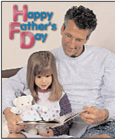
Serving Northern Berks County Northern Reading Area & Southern Schuylkill County