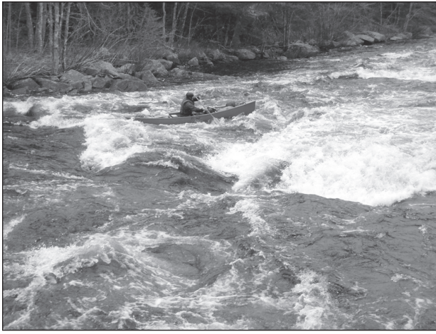
A canoeist avoids a dangerous hole on Great Falls