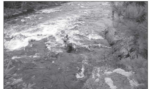
Large breaking waves are encountered on Great Falls

We encountered varying winds during our circu-