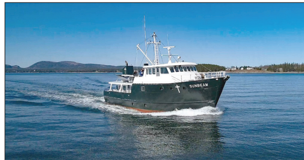
Sunbeam leaving its home port, Northeast Harbor

to strengthen coastal and island communities by educating youth, supporting families, and promoting good health. For more information, please visit https://seacoastmission.org/