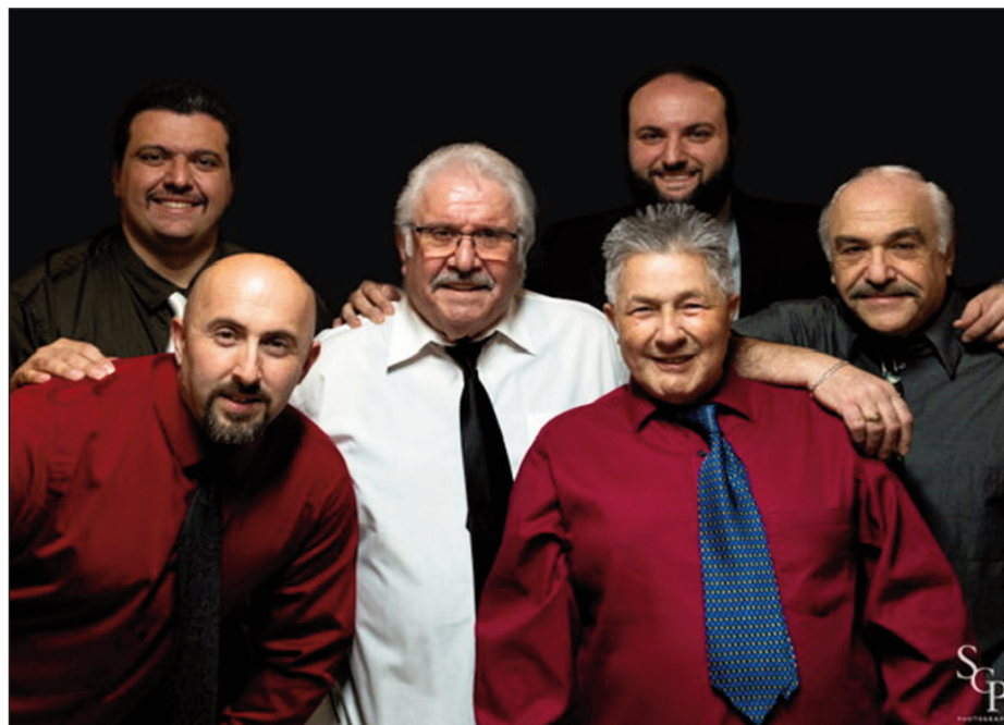
The ever-popular Italice! These talented musicians will serve up the most original and authentic Italian music at this year's Italian Family Festa.

Contact One Step Closer for more information and to enroll one.step.closer@sbcglobal.net 408-778-3567