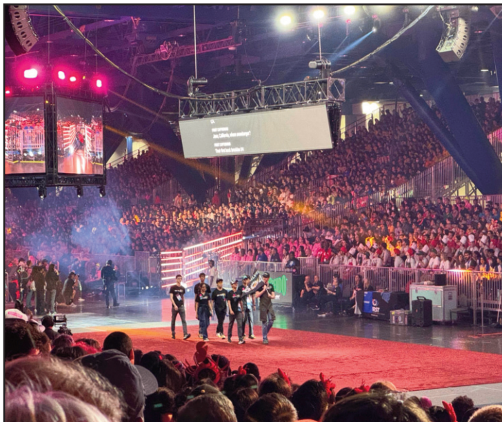
Quixilver FRC 604 enters the arena to compete.

The Quixilver team also received the Milstein