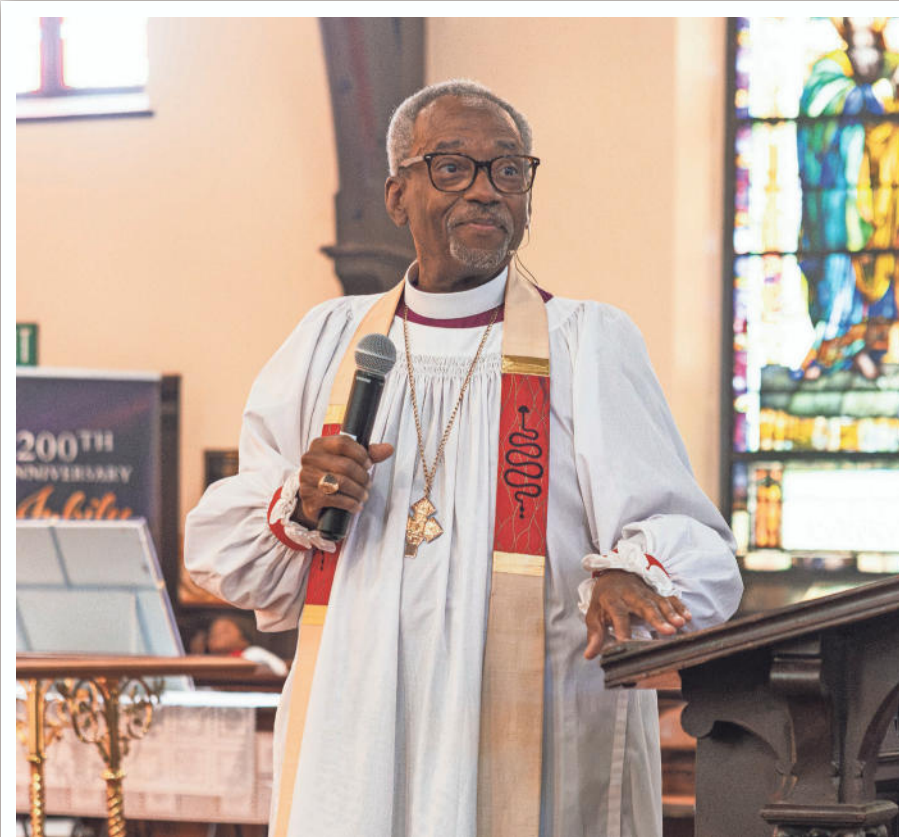
The Reverend Michael Bruce Curry, the presiding bishop and primate of The Episcopal Church, was the guest preacher for St. James Episcopal Church's 200th anniversary Jubilee. From 1988 to 2000, he served as the rector of St. James.

This year marks the church's Jubilee, which is a year-long celebration. Some events hosted so far by the church this year included a book discussion, concerts and special choir performances, and a festival.