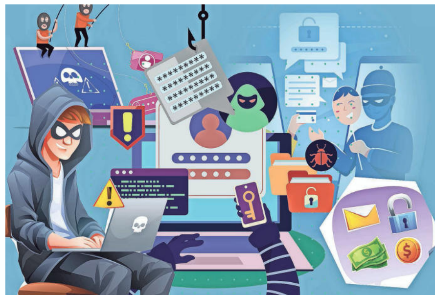
Take steps to protect your data. Graphic Design by Karen Clay

Social Media Mining: Collecting information from social media profiles to use in social engineering attacks.