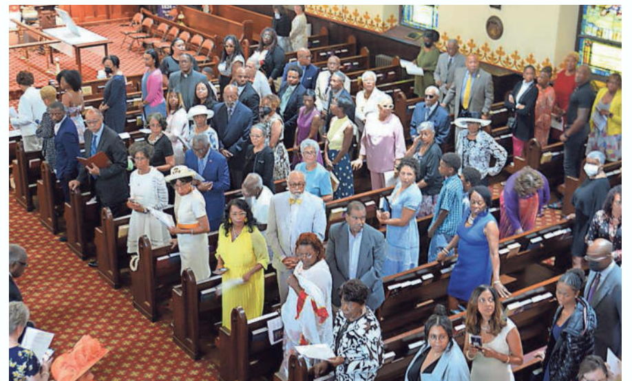
Dozens of congregants assembled for St. James Episcopal Church’s Jubilee Mass service on June 9, celebrating the church’s milestone 200th anniversary.