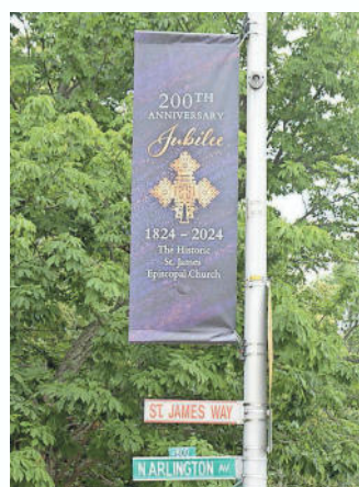
A light pole banner sits above the West Baltimore intersection of North Arlington and West Lafayette Avenues, the location of St. James Episcopal Church.