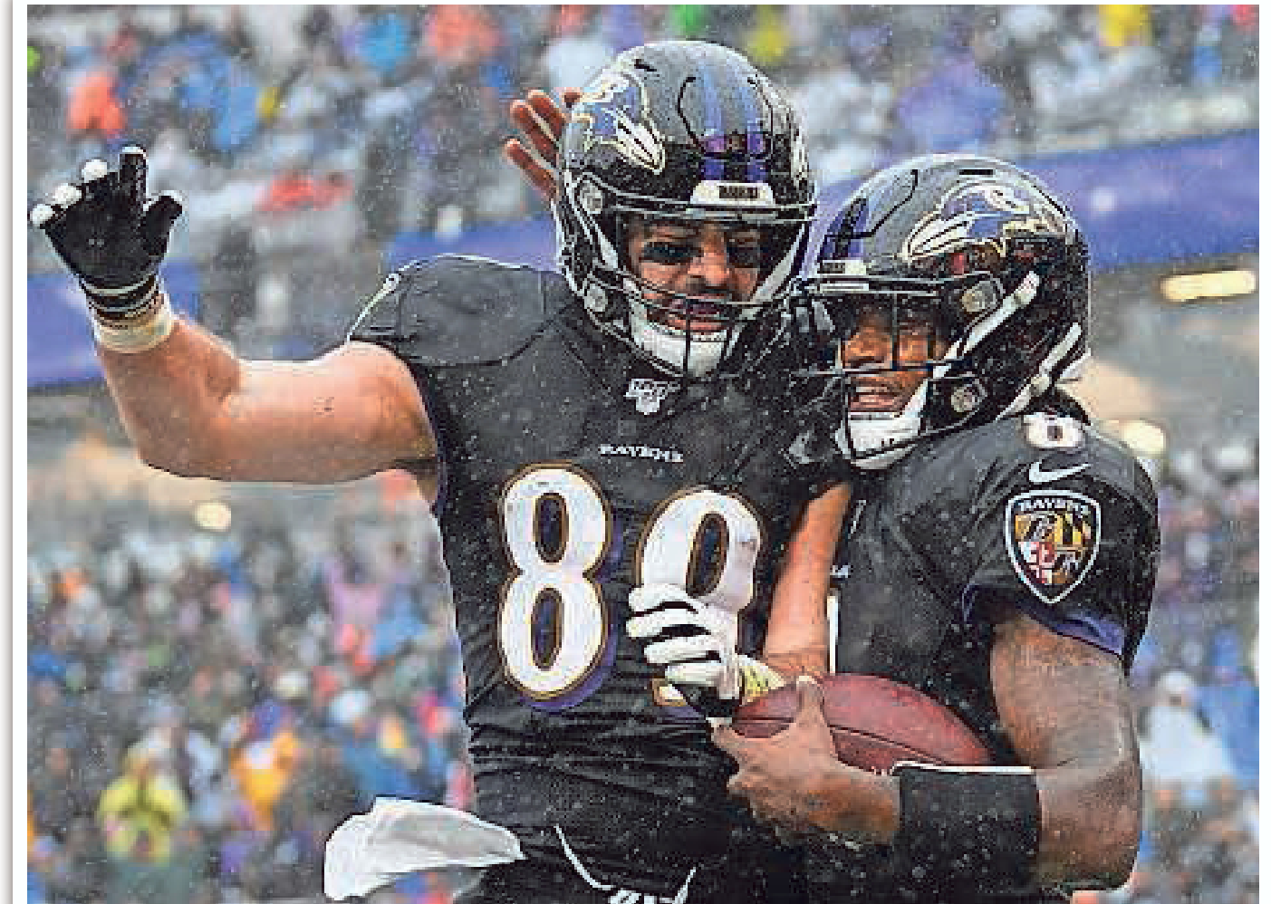
Lamar Jackson and Mark Andrews

"There's intentionality to everything we do," Harbaugh said. "There should be a plan in terms of what we're trying to accomplish every day. So, what are you trying to accomplish for the next weeks that lead into training camp to put you in position to have the best training camp to handle the loads