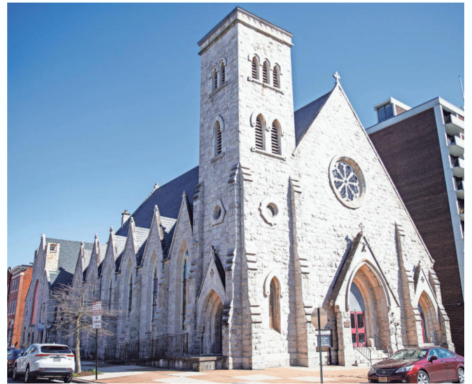
St James Episcopal Church

A number of legendary figures have either worshipped at St. James or have been honorary guests, including former Afro American Newspapers publisher Carl Murphy and Supreme Court Justice Thurgood Marshall, among many others.