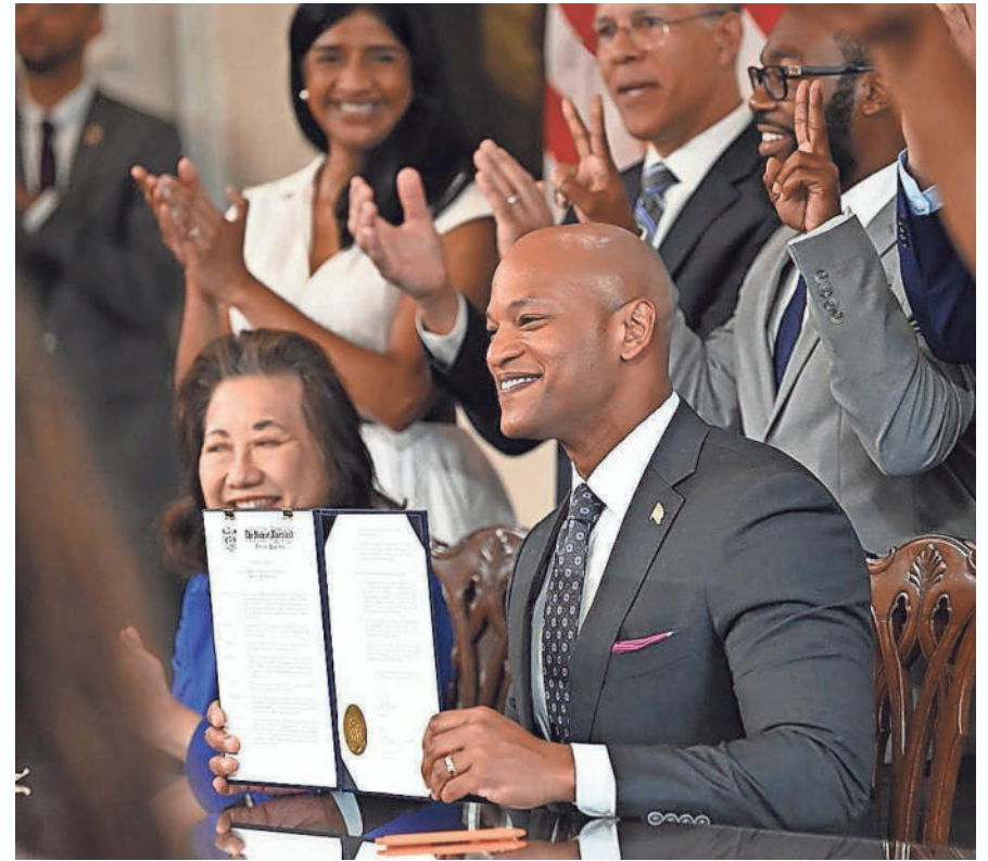
Governor Wes Moore holds the signed executive order that pardons 175,000 cannabis convictions.

• Convictions for misdemeanor possession of cannabis or misdemeanor use or possession with intent to use drug paraphernalia;