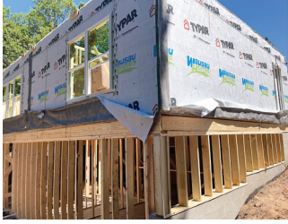
The Heesaker Habitat for Humanity home is in place and enclosed. Now it is time for volunteers to sign up to finish it.

te.irizarry@habitatforhumanityaitkincounty.org. You can also call 218-927-5656 and leave a message.