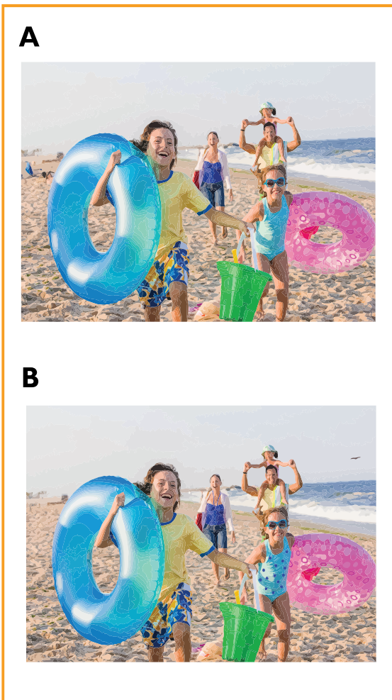
Answers: 1. Birds in sky 2. Polka dots on girl's swimsuit 3. Missing items in background 4. Woman has straps on swimsuit

There are four differences between Picture A and Picture B. Can you find them all?