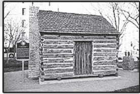
Replica of John Neely Bryan's cabin, Founders Plaza, Dallas, Texas.