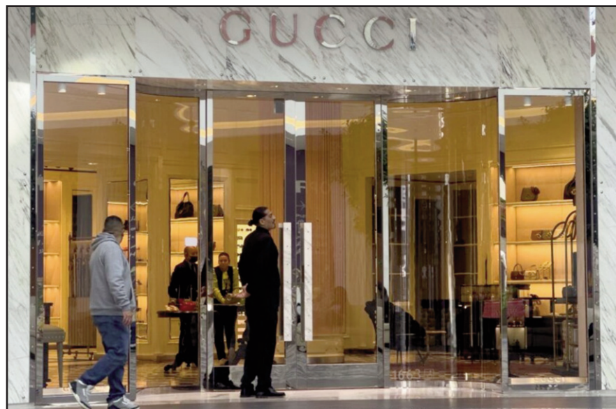
The Gucci Store in WestField Valley Fair was robbed by an organized retail theft ring last year. File photo.

A 2022 UC Berkeley Institute of Governmental Studies poll co-sponsored by