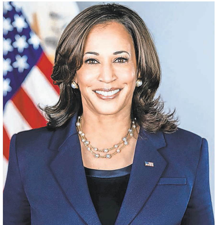
Vice President Kamala Harris

Governor Kathy Hochul of New York added her voice to the chorus of support: "I'm proud to stand beside Kamala Harris. She is the right candidate to unite our country; I am