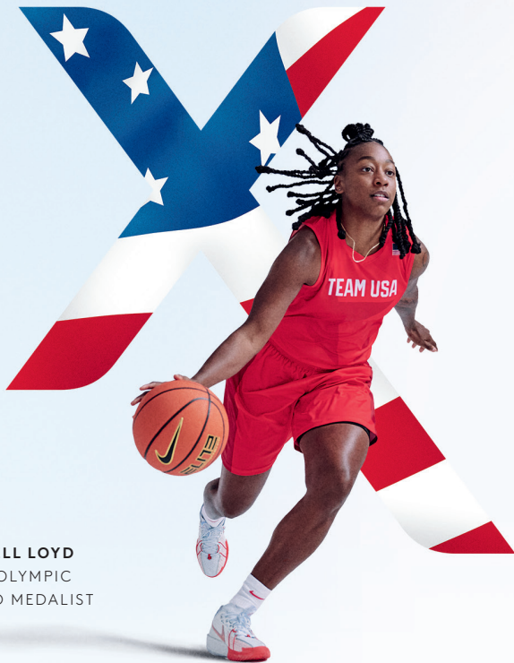
JEWELL LOYD U.S. OLYMPIC GOLD MEDALIST