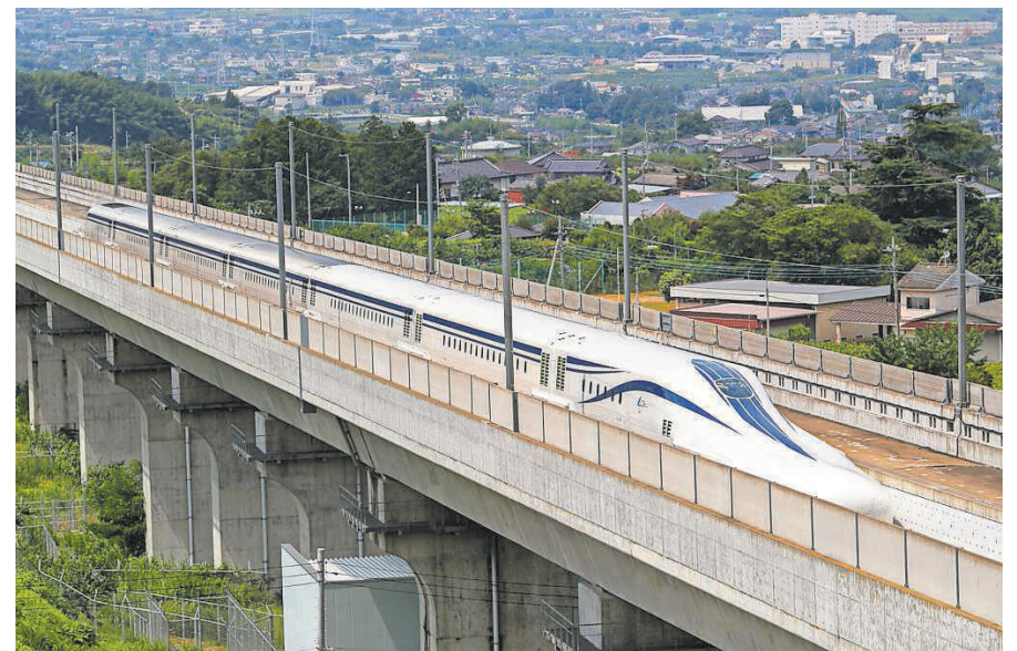
The Maglev train in Japan

Northeast Maglev has pledged $4 billion of the project cost to contracts with minority business enterprises (MBEs) as confirmed during the recent MBE & WBE Outreach Breakfast held at Coppin State University this past