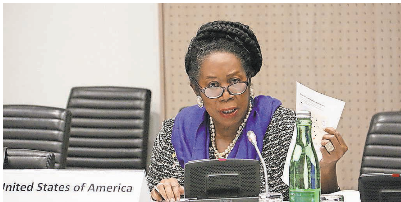
Congresswoman Sheila Jackson Lee