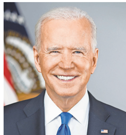
President Joe Biden, the 46th U.S. President, announced that he would not seek reelection. According to an Associated Press survey, Vice President Kamala Harris has secured enough support from the Democratic delegates to become the Democratic nominee.

In a twist of events, President Biden released a written announcement recapping progress that has been made in the United States over the past three and a half years as a Nation, including lowering prescription drug costs for seniors; expanding affordable health