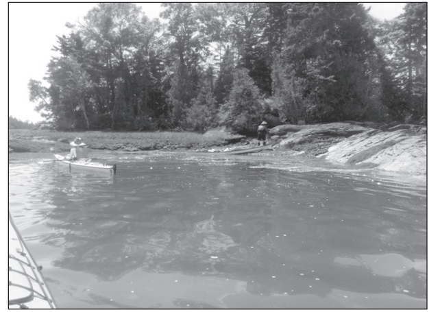
Paddlers search for a lunch spot on Quahog Bay

One of the benefits of being a member of the Penobscot Paddle & Chowder Society is that if you want to organize an impromptu outing, there is usually someone available to join you. That was true when I recently decided to organize a sea kayak trip on Quahog Bay near Cundy's Harbor.