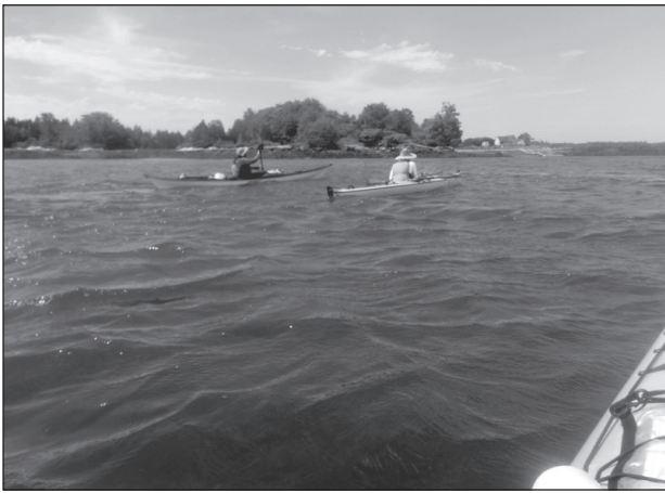
Kayakers paddle into the wind towards Yarmouth Island