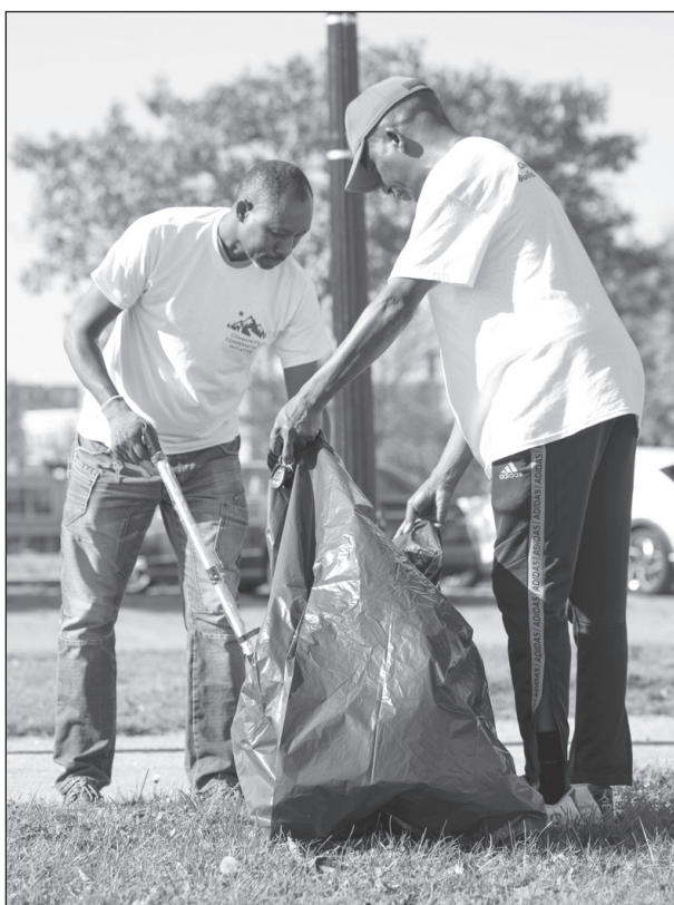
The Community Conservation Initiative (CCI) engages immigrant communities in Greater Portland in environmental conservation work. CCI received a grant from the Maine Community Foundation's Black, Indigenous and People of Color Fund for its work.

Learn more about the BIPOC Fund and view all the recent grantees, visit www.mainecef.org/bipoc . For more information, contact Senior Community Partner Gloria Aponte C. at 207-412-0847 or gapon-teclarke@mainecef.org .