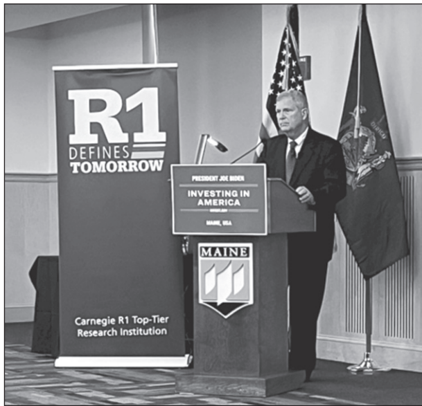
Secretary Tom Vilsack at the podium during his Investing in America Town Hall address at the University of Maine in Orono last Thursday afternoon.

REAP enables agricultural producers and rural small business owners to expand their use of wind, solar, geothermal