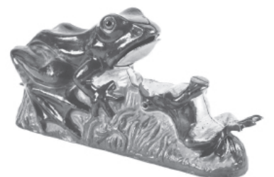
Antique mechanical banks have gone from storing pennies to selling for thousands of dollars. This frog bank is well known and highly prized, selling recently for $12,800 at auction.

A: To estimate the date of a piece of furniture from family history, take your age and add 25 years for each generation before you owned the piece. By this method, your great aunt's table would be about 107 years old. However, this method isn't always accurate. If you don't know how old your relative was when they got the piece, you may estimate that the furniture is older than it really is. Without a maker's mark, it is difficult to determine the age of a piece of furniture