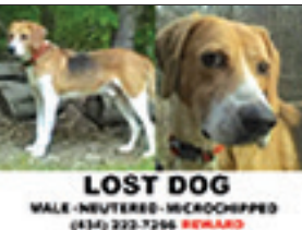
LOST DOG MALE - INTERMEDIATE - MICROCHIPPED (434) 333-7256

Rehoming German Shepard Puppies. AKC. Great Temperament. Vet Checked. Health Tested Parents. Taking Applications. Asking $250. Axton, Va. Call 276-403-2437.